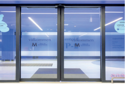
Mall of Scandinavia, Sweden

GEZE automatic door solutions reflect sober elegance, smooth accessibility and a focus on sustainability.