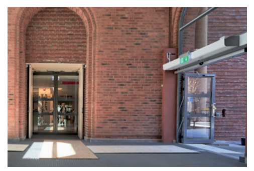
The Carlanderska Private Hospital, Sweden

With an extensive range of solutions, GEZEs door automatics provides barrier-free entrances in locations where people are extra vulnerable.