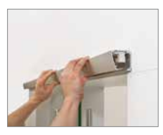
5. Clipping the clip-on cover