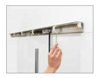
4. Mounting the clip-on cover bracket using the same Allen key