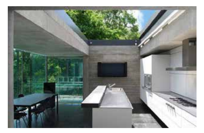
Rooflight on flat roof extension

As mentioned previously, although Security Rating A is the only required test for the Building Regulations Part Q, a further test using an enhanced set of tools can prolong the attack for up to three minutes; this is then awarded a Security Rating B .