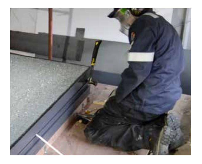
Part Q security testing process on Visionvent opening glass rooflight.

To prevent opening sections being forcibly pried open, it is often better to look for products with dual locking systems at either end, which will make any attempt to open the rooflight much more difficult. Electrically operated and motorized systems should not be possible to be 'back driven'.