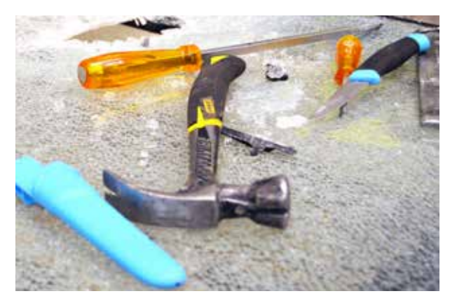
Examples of toolsets used in LPS 2081 test