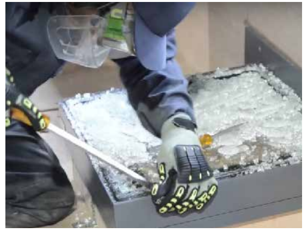
'Testing fixed Flushglaze rooflights in line with part Q building regulations'

LPS 2081 specifically addresses offering resistance to opportunist intruders attempting 'stealth' attacks to gain entry