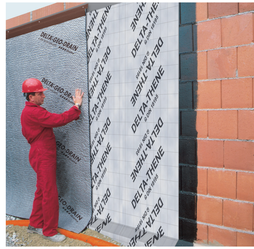
DELTA®-GEO-DRAIN Quattro and DELTA®-THENE are designed for swift installation.