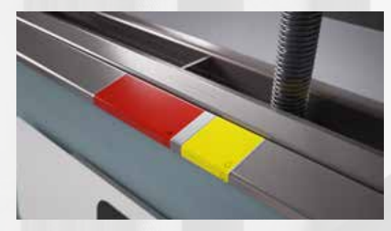
The emergency stop and alarm button of the Cibes Air have a discreet, and elegant design, created exclusively by and for Cibes.