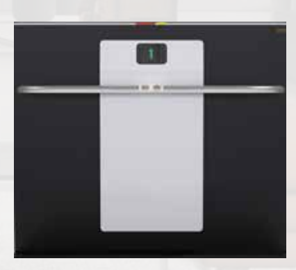
The front panel of the Cibes Airincludes a 7" display with a level indicator, covered with elegant mirror glass.