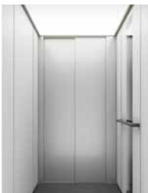
Walls: White laminate, open through with white door with matching profiles. Black touch control. Light screen ceiling.