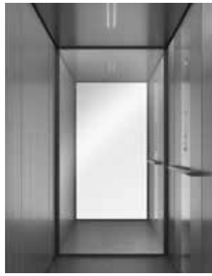
Walls: Brushed Argent laminate, mirror. Coated control in RAL9006. Coated ceiling in RAL 9006 with LED-light.