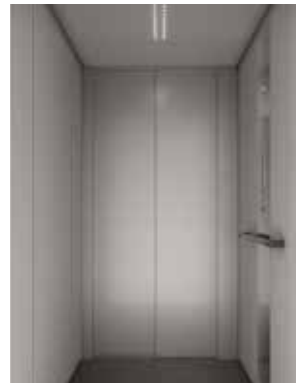
Walls: Folkstone laminate, matching profiles RAL830. Open through with white door. Control panel stainless steel. Ceiling: RAL830 with LED-light.