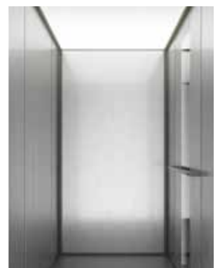
Walls: Brushed Argent laminate, Black profiles. Black touch control. Light screen ceiling.