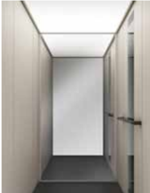
Walls: Laminate: Oyster grey, mirror and laminate with matching coated profiles: RAL1015. Black touch control. Light screen ceiling.