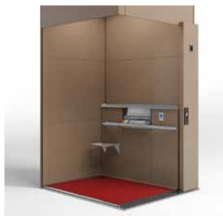
Shaft: Anodic Gold Platform: Anodic Gold Floor: Red Pepper