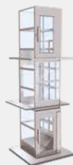
2. Open-through (3 stops)