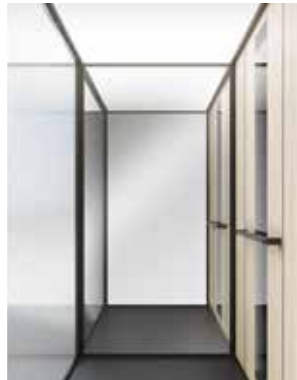
Walls: Glass, mirror and laminate: Polar Aland Pine. Black profiles. Touch control. Light screen ceiling.