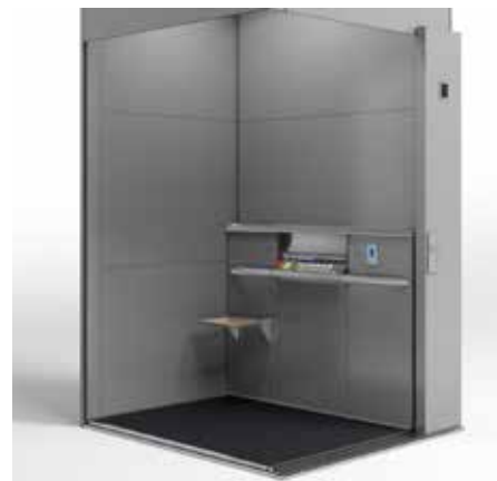
Shaft: RAL 9006 Platform: RAL 9016 Floor: Standard black