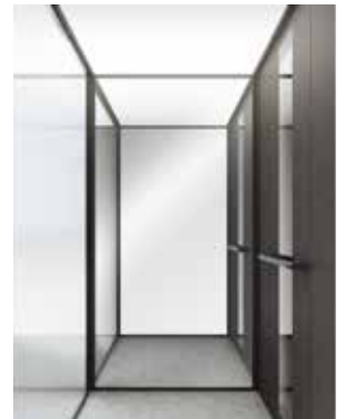
Walls: Glass, mirror and laminate: Black Wood. Black profiles. Touch control. Light screen ceiling.