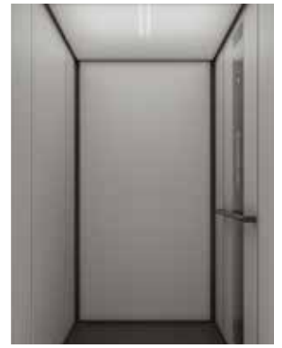
Walls: Folkstone laminate, black coated profiles. Black coated control. White coated ceiling with LED-light.