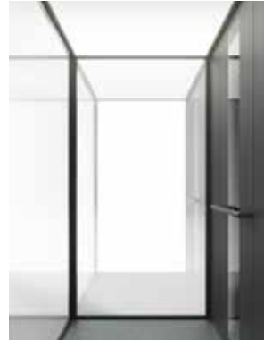
Walls: Glass, glass and laminate: Terril. Black profiles. Black touch control. Light screen ceiling.