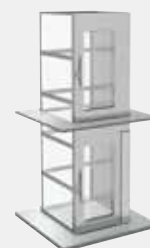
1. Single entry (2 stops)