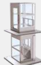
2. Adjacent (2 stops)