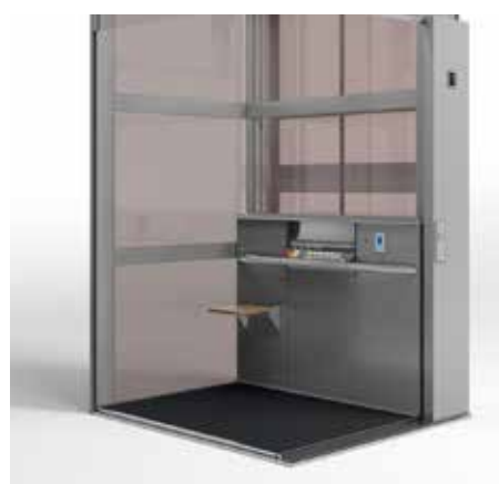
Shaft: Tinted glass/RAL 9006 Platform: RAL 9006 Floor: Standard black