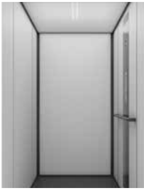
Walls: White standard laminate. Black profiles. Control panel: Black. Ceiling with LED light RAL 9016.