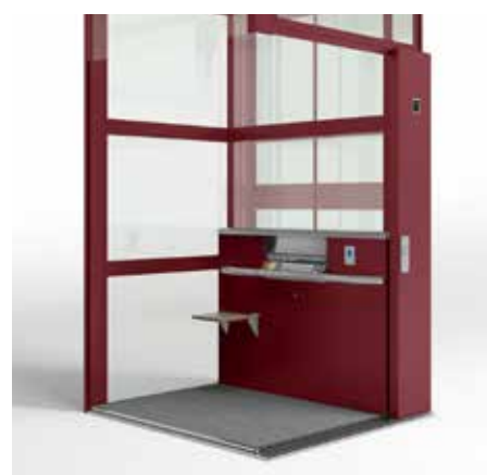
Shaft: Clear glass/RAL 7021 Platform: RAL 7021 Floor: Quartz stone