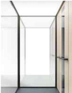
Walls: Glass and laminate: Magnolia. Black profiles. Touch control. Light screen ceiling.