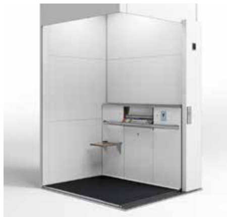
Shaft: RAL 9016 Platform: RAL 9016 Floor: Standard black