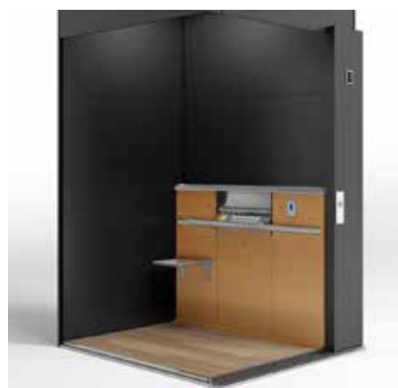
Shaft: RAL 7021 Platform: Anodic Gold Floor: Rustic Oak