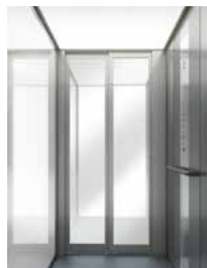
Walls: Glass, open through with glass door. Brushed Argent laminate, Black profiles. Control panel: Stainless steel. Light screen ceiling.