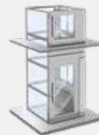
1. Single entry (2 stops)