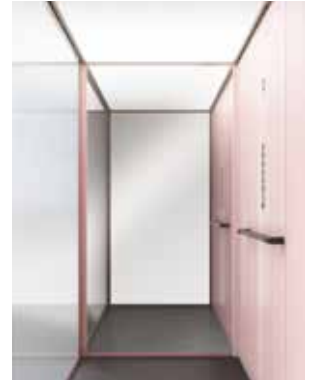
Walls: Glass, mirror and laminate: Just Rose. Matching coated profiles and control panel RAL 490. Light screen ceiling.