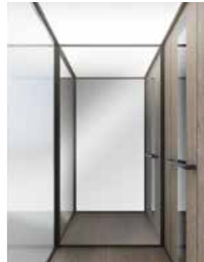
Walls: Glass, mirror and laminate: Nevada Oak. Black profiles. Touch control. Light screen ceiling. Floor: Rustic Oak.