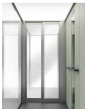
Walls: Glass, open through with glass door. Fontana laminate, black profiles. Black touch control. Light screen ceiling.