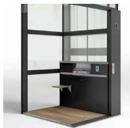
Shaft: Clear glass/RAL 7021 Platform: RAL 7021 Floor: Rustic Oak