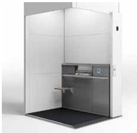
Shaft: RAL 9016 Platform: RAL 9006 Floor: Standard black