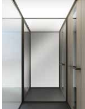
Walls: Glass, mirror and laminate: Otter. Black profiles. Black touch control. Light screen ceiling.