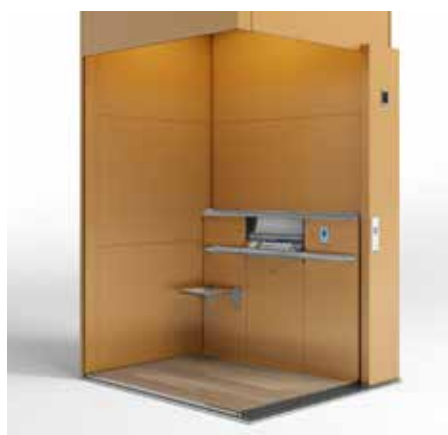
Shaft: Anodic Gold Platform: Anodic Gold Floor: Rustic Oak