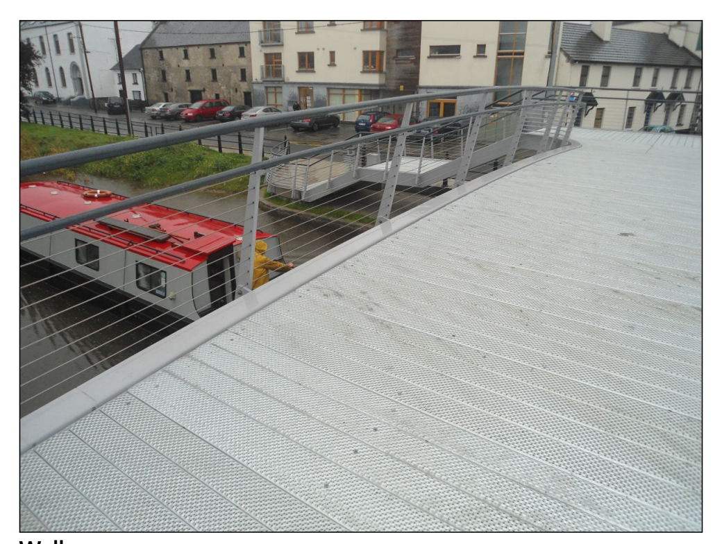
Type O5 - 150/53+15mm HSS420 (Galvanised)