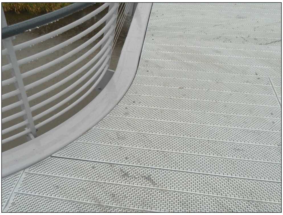
Walkways Type O5 - 150/53+15mm HSS420 (Galvanised)