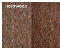
Previous Woodstain Ultimate Woodstain