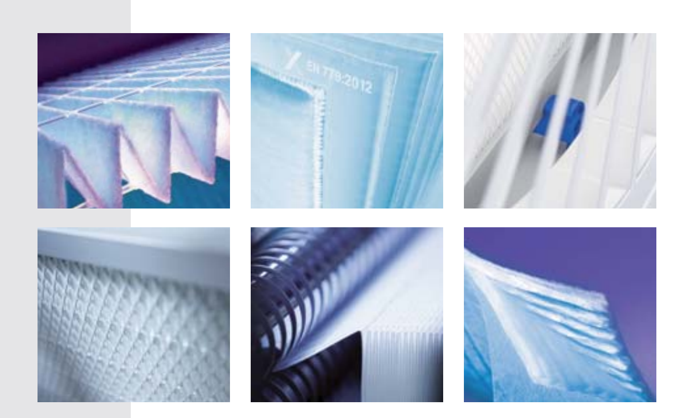
► Filter Technology from A to Z ► ► Filter units and filter elements from TROX