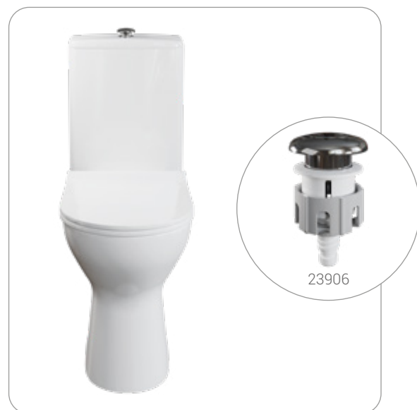
Livenza Plus WC & cistern with raised push button flush