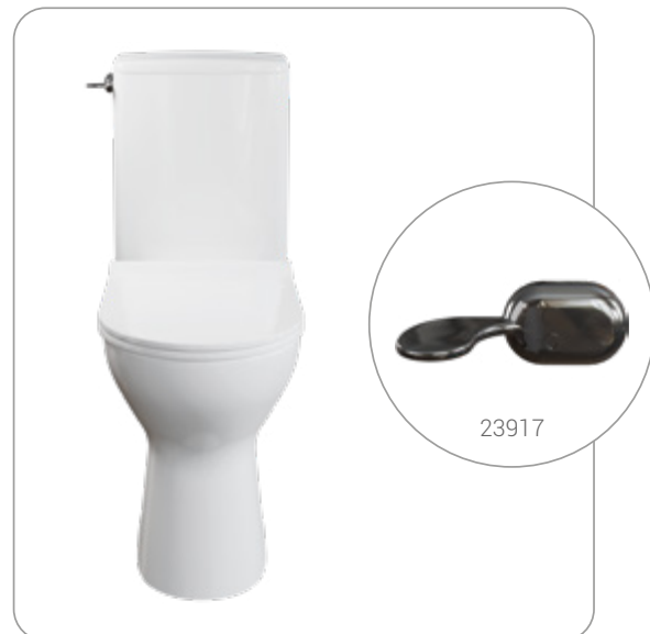
Livenza Plus WC & cistern with lever flush

The stylish new Livenza Plus WC has been designed to complement any bathroom look; it also features a rimless toilet pan, fully compliant cistern, and offers a choice of seat and flush options.