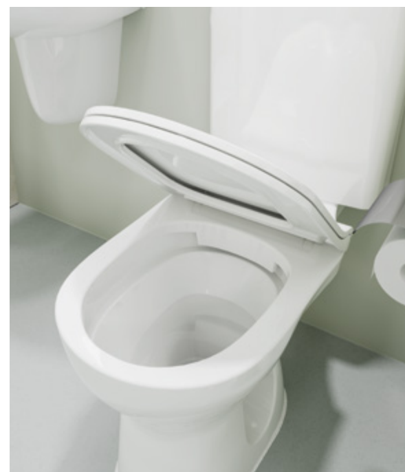
NEW rimless pan for improved hygiene

The Livenza Plus collection is versatile and flexible, with a variety of stylish pedestal, seat and flush options to suit your requirements, and a wide range of brassware products to complement and complete any bathroom look.