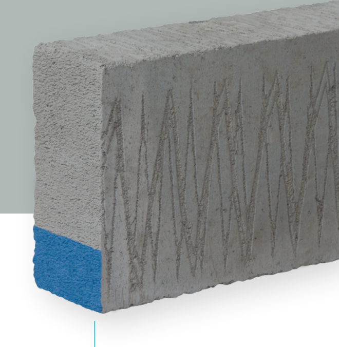
Solar Grade (blue)

Solar Grade is principally used where enhanced thermal performance is required.