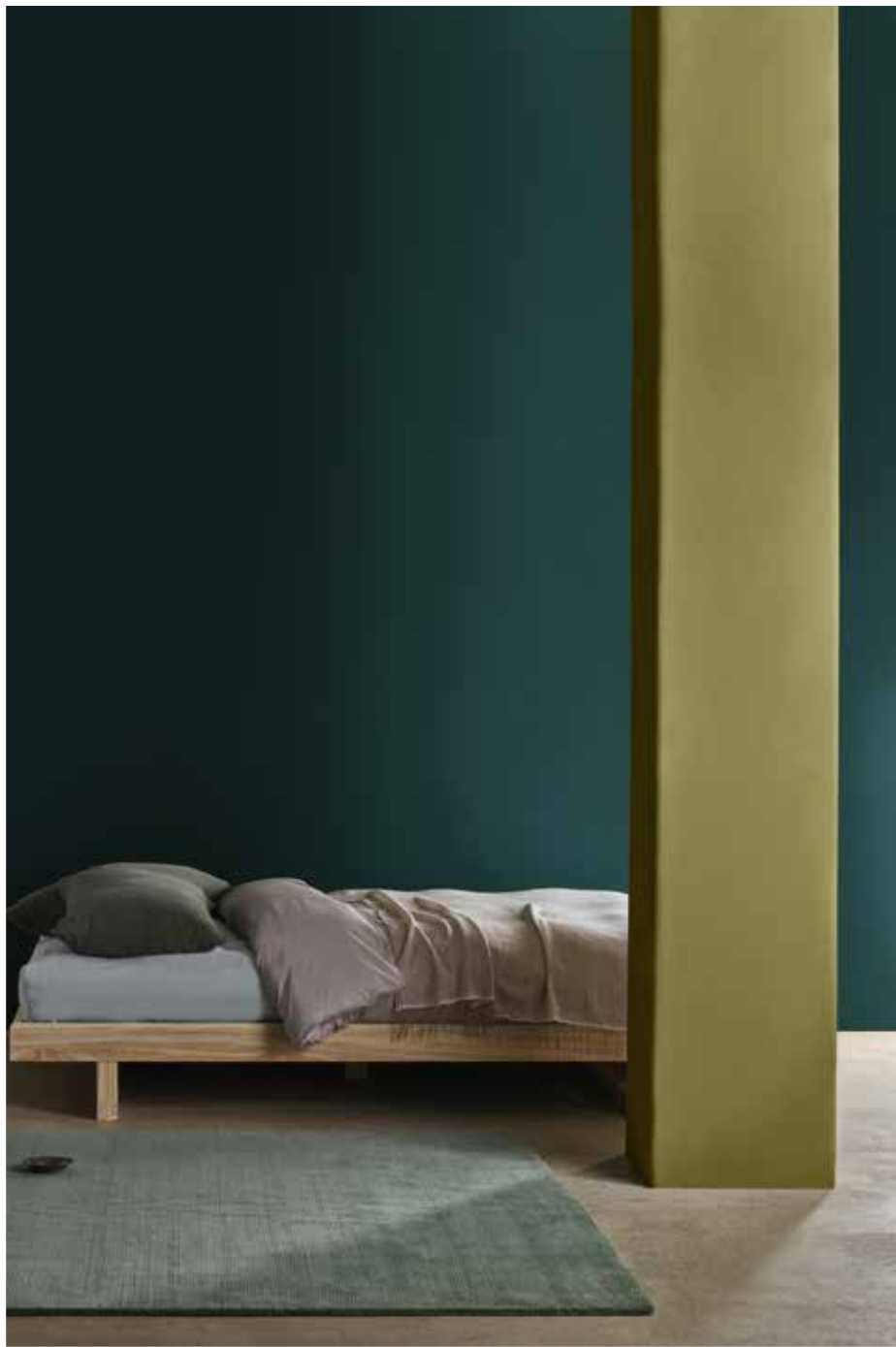
botanical noir® khaki twist®