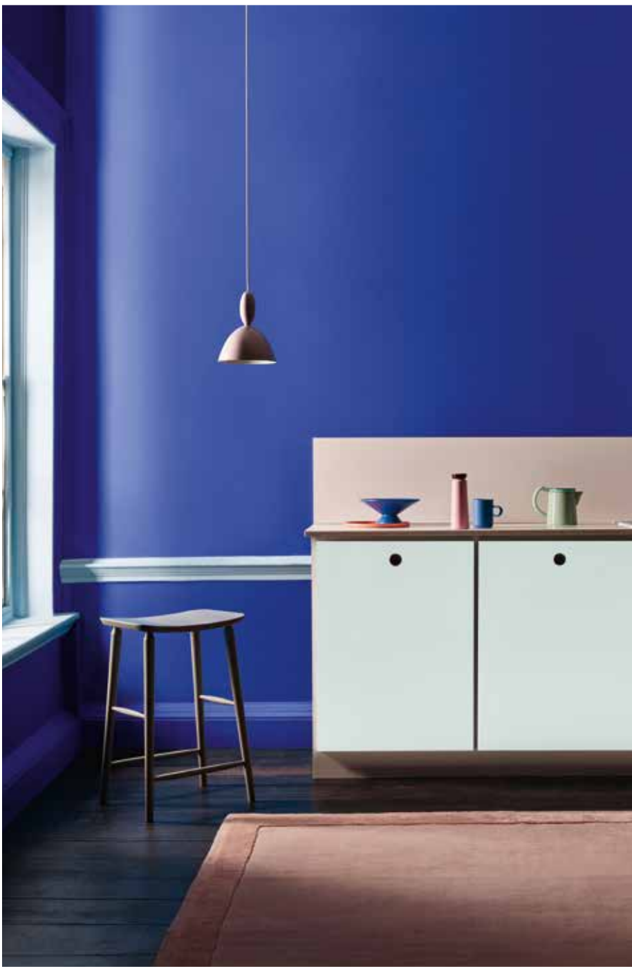
into the blue°. powder blue . revival°. ballet shoes°