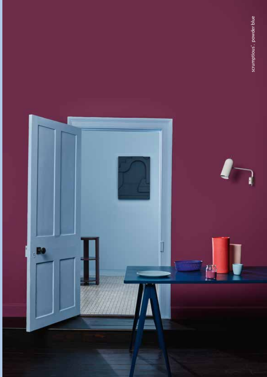
scrumptious°. powder blue