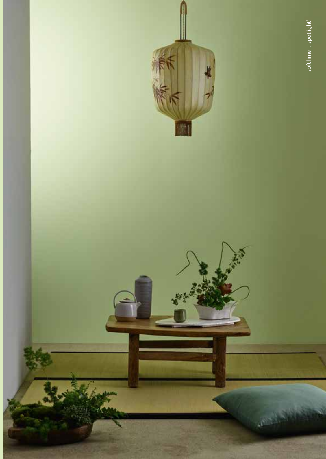
soft lime . spotlight®