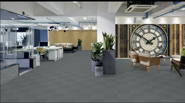
Full wall graphics create a dynamic and exciting work environment.

Please contact us to discuss further your requirements. We are confident we can provide the solution.