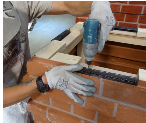
Anti-condensation, proper ventilation to chimney top.