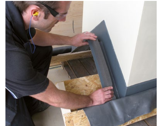
All flashings and lead apron incorporated into SMARTstack .