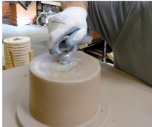
Convenient hook-eye for safe handling and fast installation.