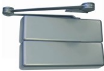
4040XP.TANDEM.US28 Stop Face (Push Side) Mounting (Handed)*