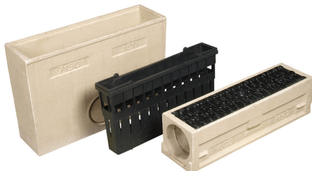
Sump unit composite grating, with silt bucket Load Class C 250