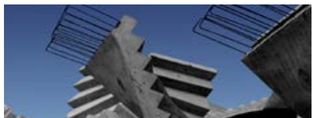
High Early Strength Concrete