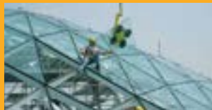
SEALING AND BONDING