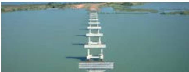
High Strength Concrete