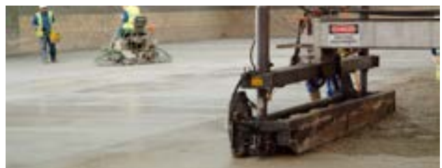
Concrete Systems for Floors