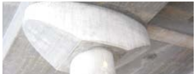
Self Compacting Concrete (SCC)