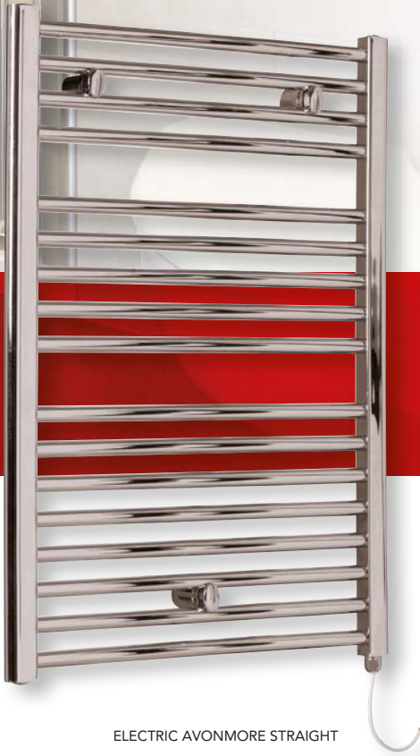
ELECTRIC AVONMORE STRAIGHT

HYDRONIC MODEL AVAILABLE Please see page 132