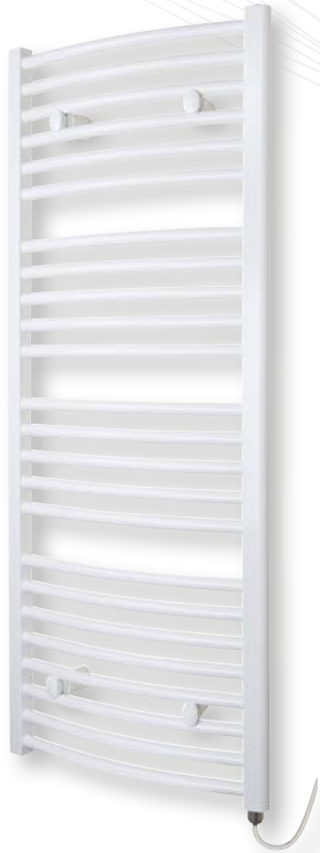
ELECTRIC AVONMORE CURVED