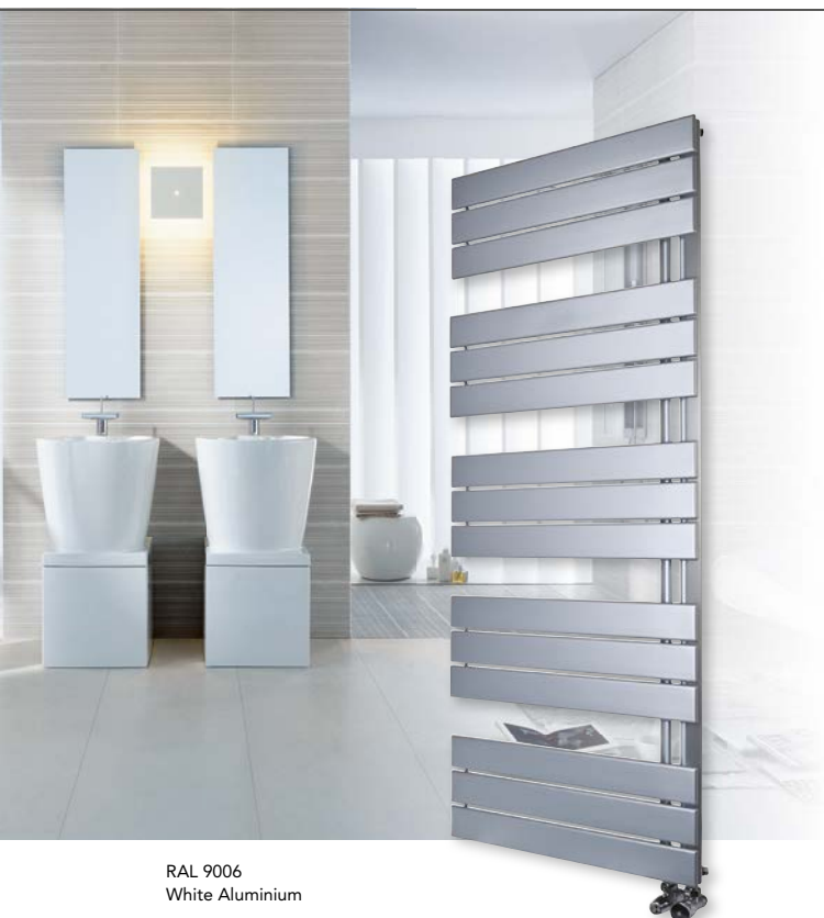
RAL 9006 White Aluminium