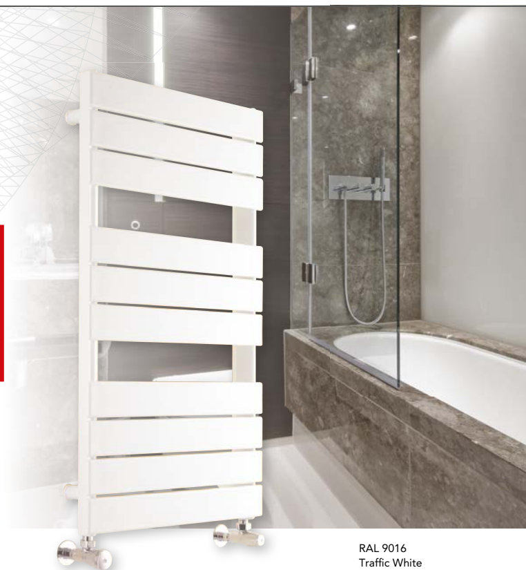
RAL 9016 Traffic White

INTERLUDE is a simple and elegant flat tube radiator. It is manufactured from quality steel and has a sleek and streamlined appearance. It is both practical and attractive and is available in selected RAL, metallic or special metallic finishes.