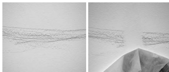
Easy to clean with damp cleaning wipes.

IN A NUTSHELL: Maximum hiding power, enormous efficiency and best application properties save time and material – which means: Maximum success for the painter!