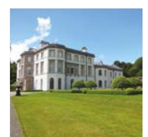
KEIM NHL Kalkputz