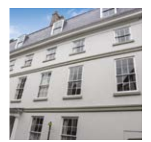
KEIM Universal Render