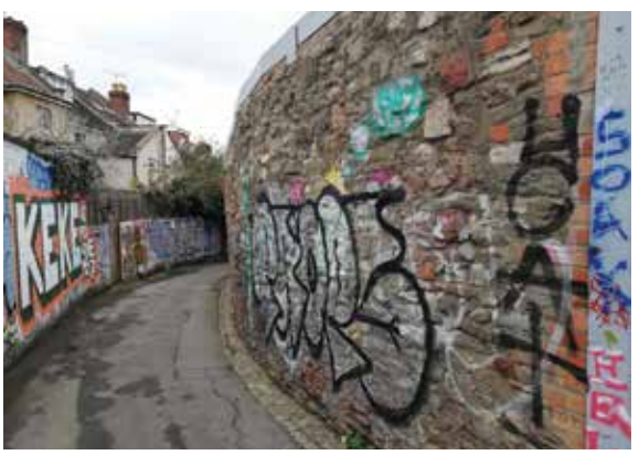
Anti-Graffiti Finishes: KEIM MX Glaze KEIM Wax Coating