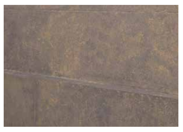
Colourwash Finishes: KEIM Lasur Range