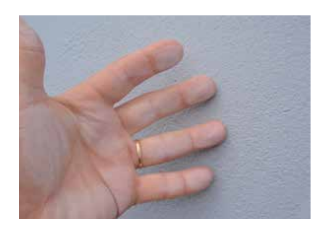
Dust Suppressant Finishes: KEIM Lotexan/N KEIM Ecotec KEIM Fixativ