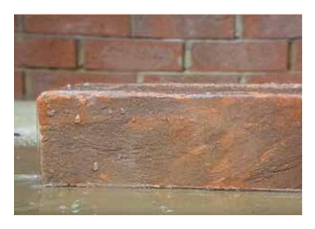
Water Repellent Finishes: KEIM Lotexan/N KEIM Ecotec KEIM Silan 100

KEIM's special products are all developed using the same philosophy as our mineral paint systems, to ensure substrate breathability, durability and longevity.