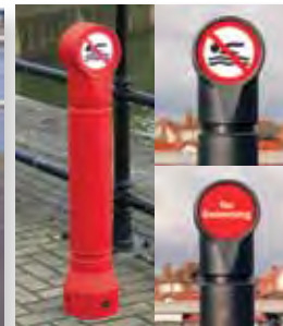
Mini-Ensign™ Sign Carrying Bollard