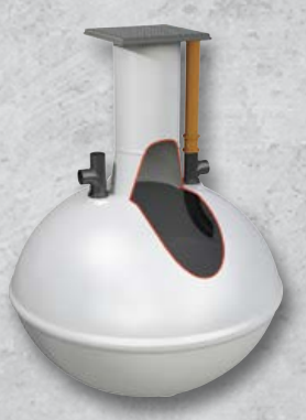
ALPHA SEPTIC TANK