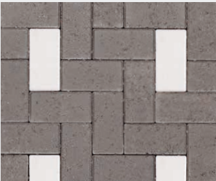
White / Ballotini †

Demarcation block paving is faced with either a non-reflective epoxy paint, or ballotini glass beads can be integrated to the surface of the painted block to reflect light.