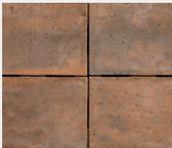
Golden Brindle *