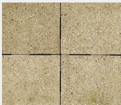
Tintagel * †