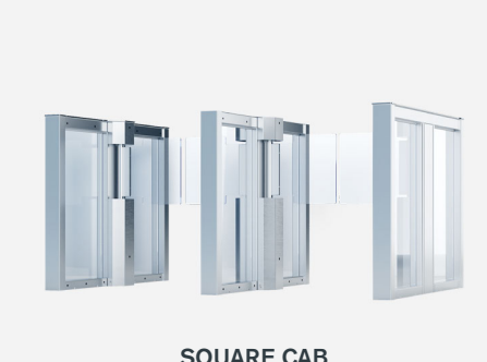
SQUARE CAB Glass Height = 905mm Width of Passage = 650 or 900 mm