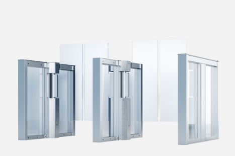
SQUARE CAB Glass Height = 1303mm Width of Passage = 650 or 900mm