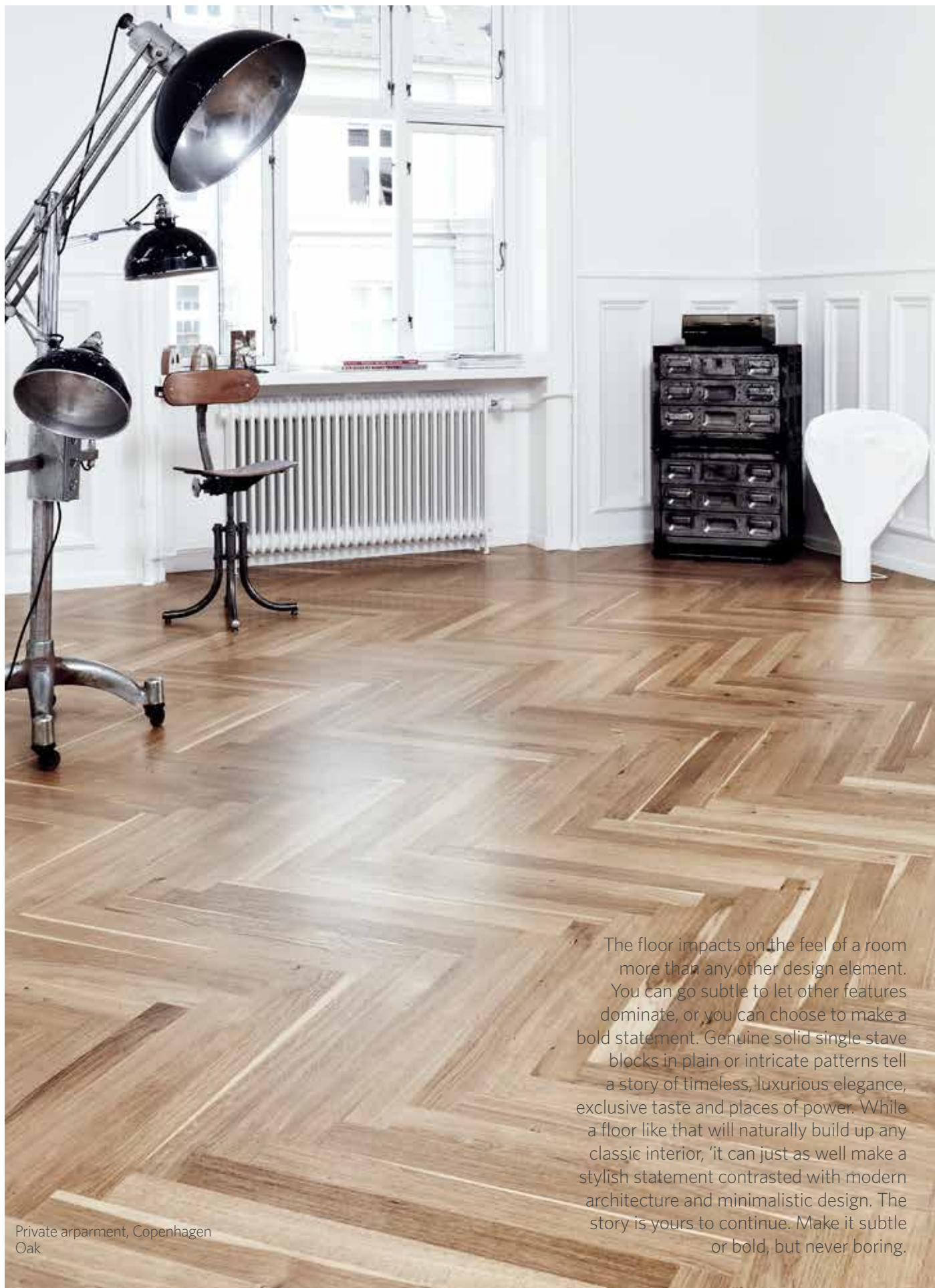
Private apartment, Copenhagen Oak

The floor impacts on the feel of a room more than any other design element. You can go subtle to let other features dominate, or you can choose to make a bold statement. Genuine solid single stave blocks in plain or intricate patterns tell a story of timeless, luxurious elegance, exclusive taste and places of power. While a floor like that will naturally build up any classic interior, it can just as well make a stylish statement contrasted with modern architecture and minimalistic design. The story is yours to continue. Make it subtle or bold, but never boring.