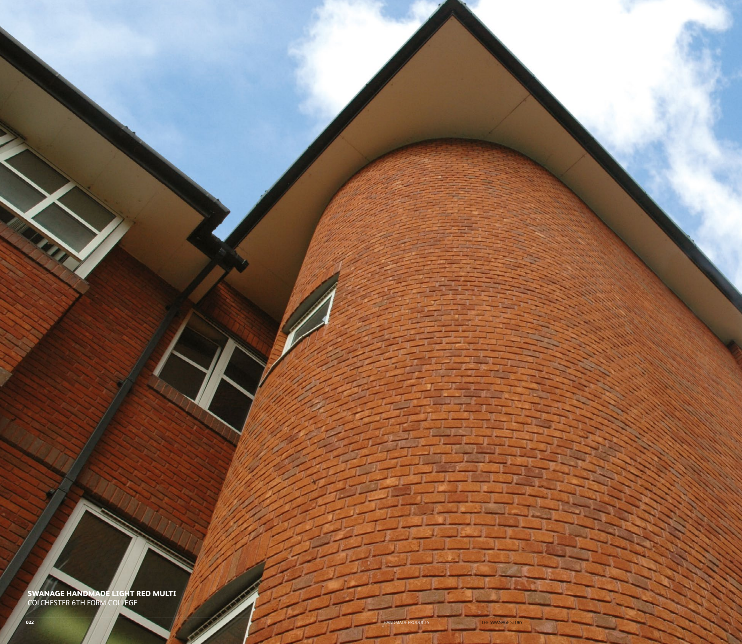
SWANAGE HANDMADE LIGHT RED MULTI COLCHESTER 6TH FORM COLLEGE