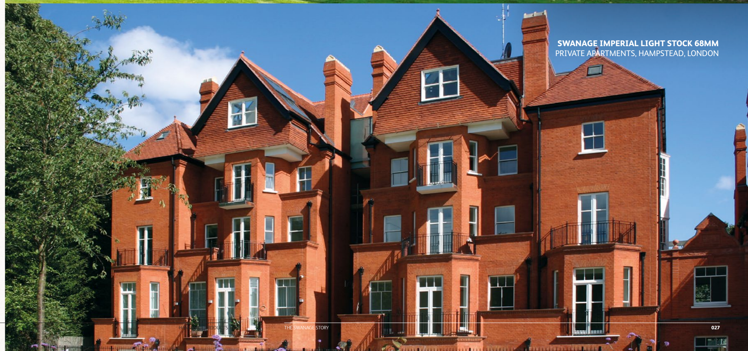
SWANAGE IMPERIAL LIGHT STOCK 68MM PRIVATE APARTMENTS, HAMPSTEAD, LONDON