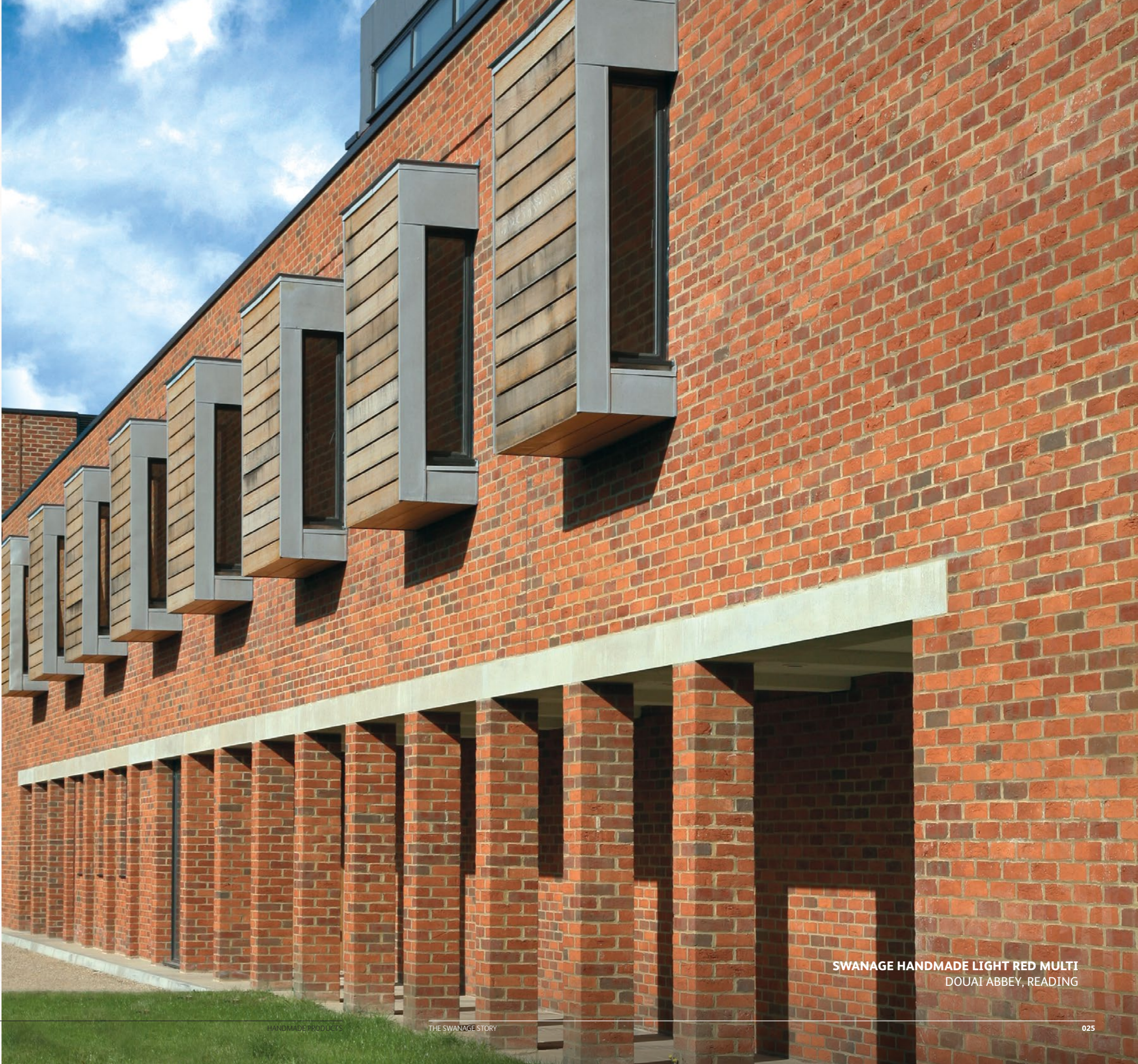
SWANAGE HANDMADE LIGHT RED MULTI DOUAI ABBEY, READING