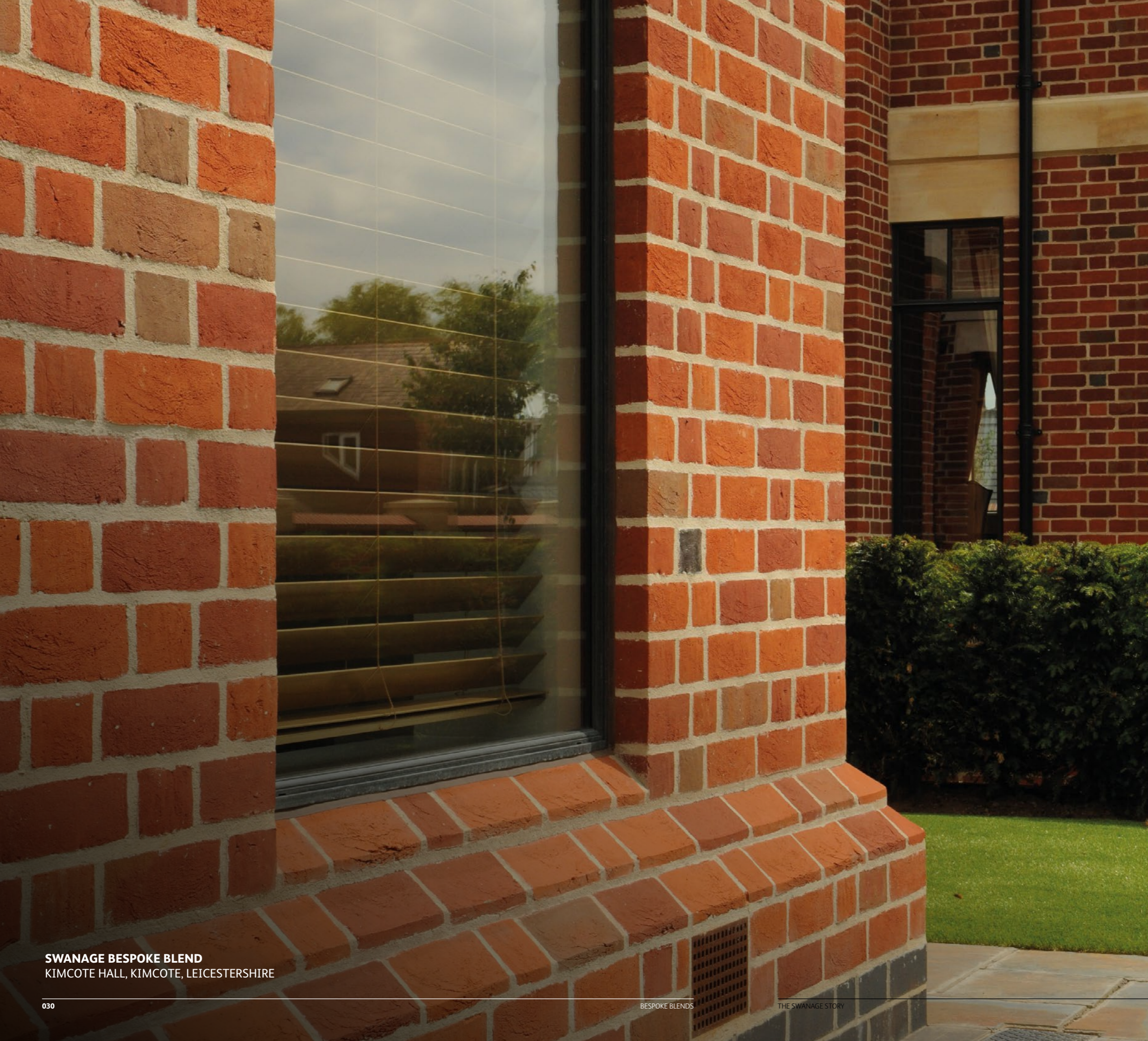
SWANAGE BESPOKE BLEND KIMCOTE HALL, KIMCOTE, LEICESTERSHIRE