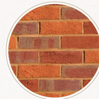
SWANAGE BESPOKE BLEND KIMCOTE HALL, KIMCOTE, LEICESTERSHIRE