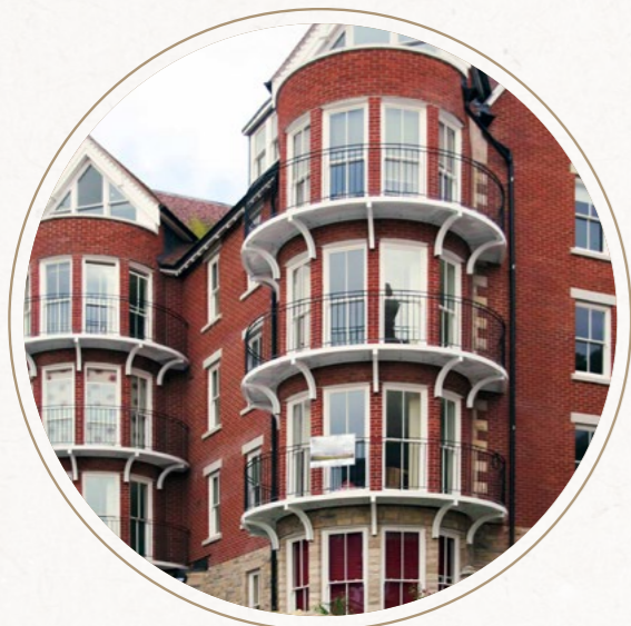
SWANAGE HANDMADE HEATHER RED PENLU FLATS, SWANAGE