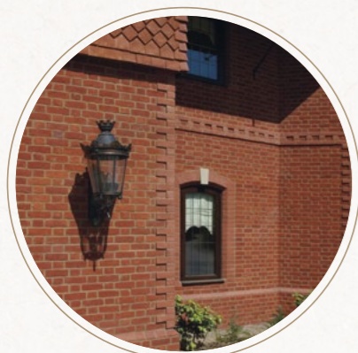
SWANAGE HANDMADE RESTORATION RED HOTEL, BINLEY, COVENTRY