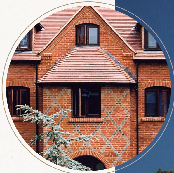
SWANAGE BESPOKE BLEND SHIPLAKE COLLEGE, READING, BERKSHIRE