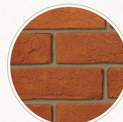
SWANAGE HANDMADE LIGHT RED 4302