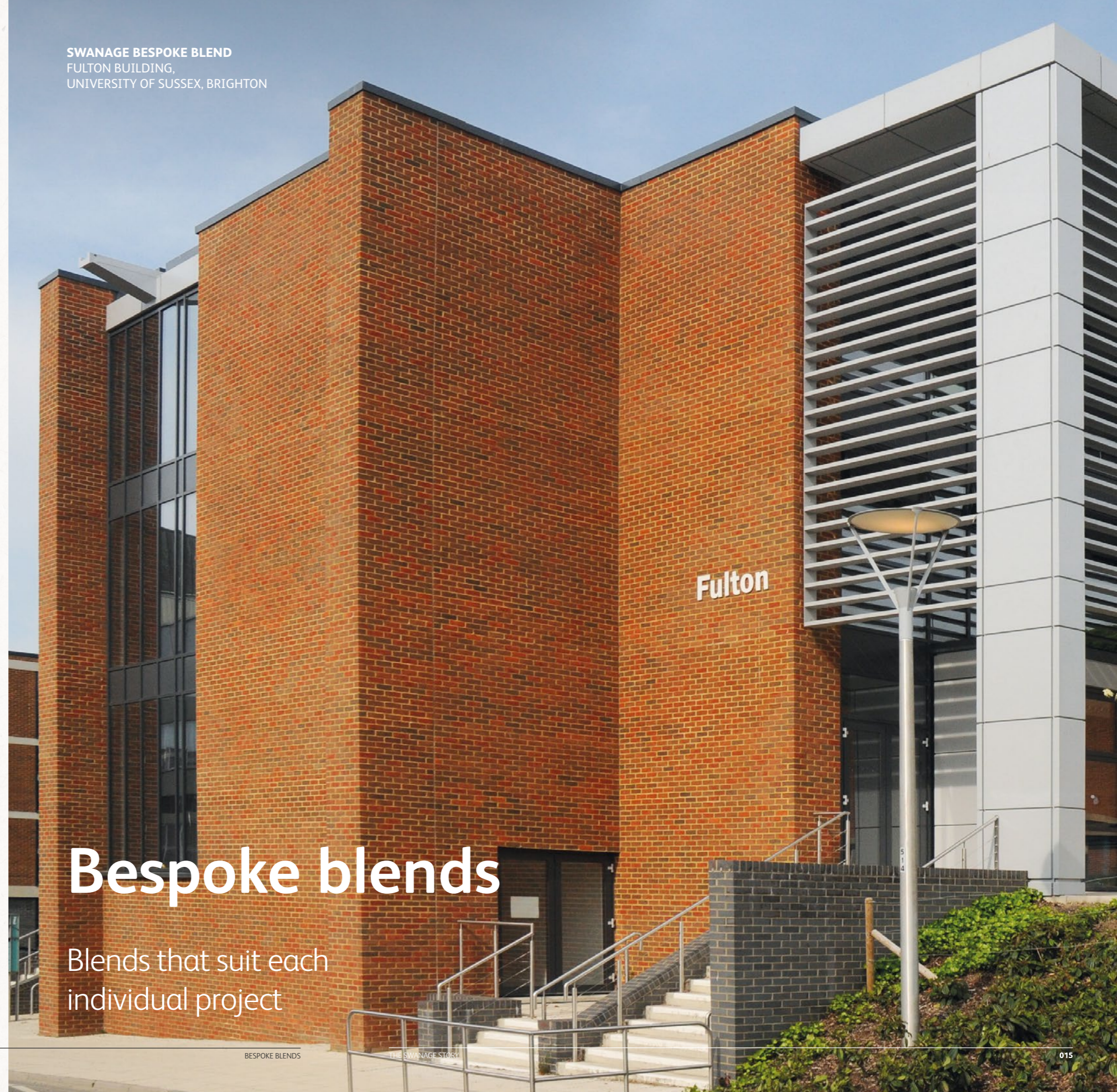
SWANAGE BESPOKE BLEND FULTON BUILDING, UNIVERSITY OF SUSSEX, BRIGHTON