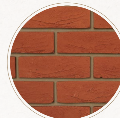
KINGSTON HANDMADE RESTORATION RED 4354