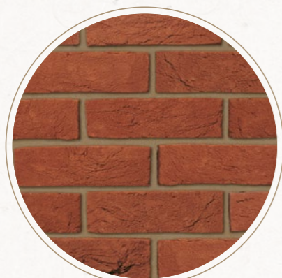
SWANAGE HANDMADE RESTORATION RED 4312