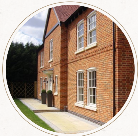
SWANAGE HANDMADE LIGHT RED MULTI

Our bricks are made in the same traditional ways using clay from the same quarry for the last 150 years.