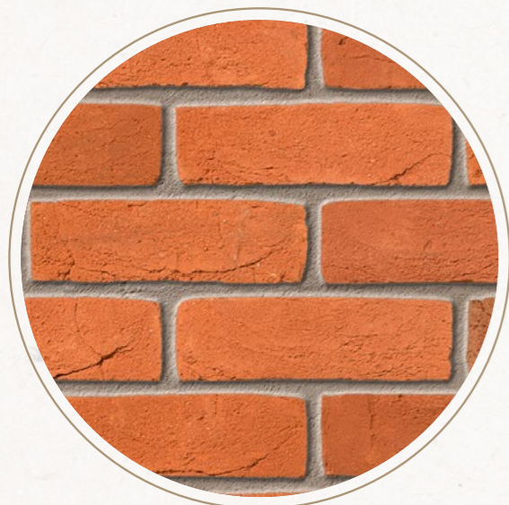
SWANAGE HANDMADE LIGHT RED MULTI 4303