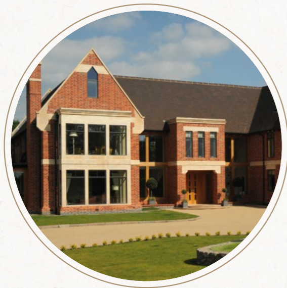
SWANAGE BESPOKE BLEND KIMCOTE HALL, KIMCOTE, LEICESTERSHIRE