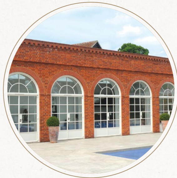
SWANAGE BESPOKE BLEND ORANGERY, READING, BERKSHIRE