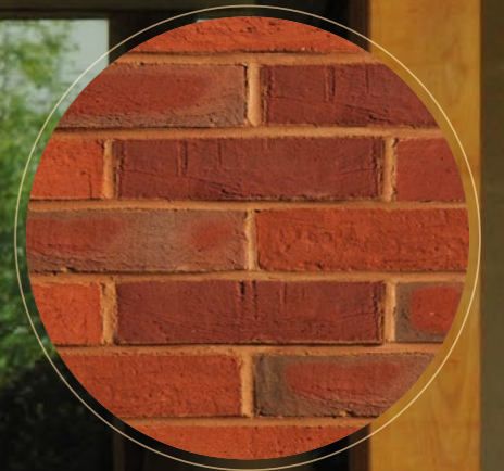
SWANAGE BESPOKE BLEND B IMPERIAL FORMAT