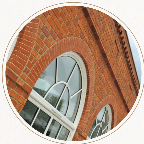
SWANAGE BESPOKE BLEND ORANGERY, READING, BERKSHIRE