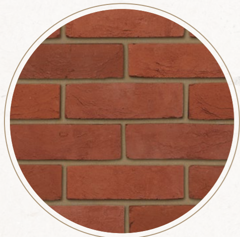
KINGSTON HANDMADE HEATHER RED 4355