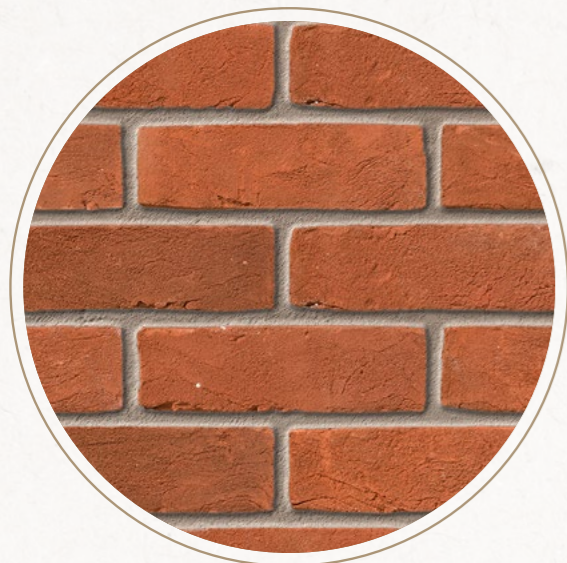
SWANAGE HANDMADE HEATHER RED 4301