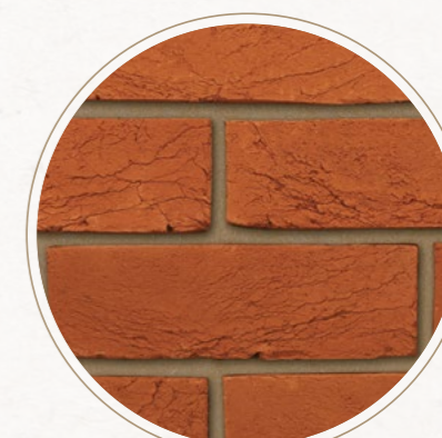
KINGSTON HANDMADE LIGHT RED 4357