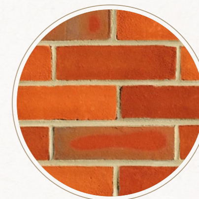
SWANAGE BESPOKE BLEND E