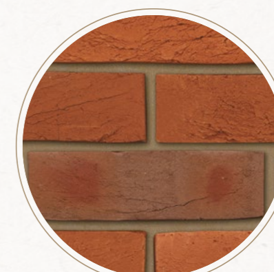
KINGSTON HANDMADE LIGHT RED MULTI 4356