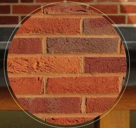
SWANAGE BESPOKE BLEND A 50MM FORMAT

For more information on Swanage bespoke blends contact Mark Woolston on 01929 422257 .