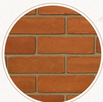
SWANAGE IMPERIAL LIGHT STOCK 68MM 4317