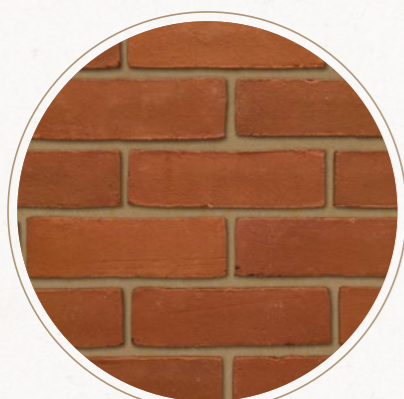
SWANAGE IMPERIAL RED STOCK 68MM 4316