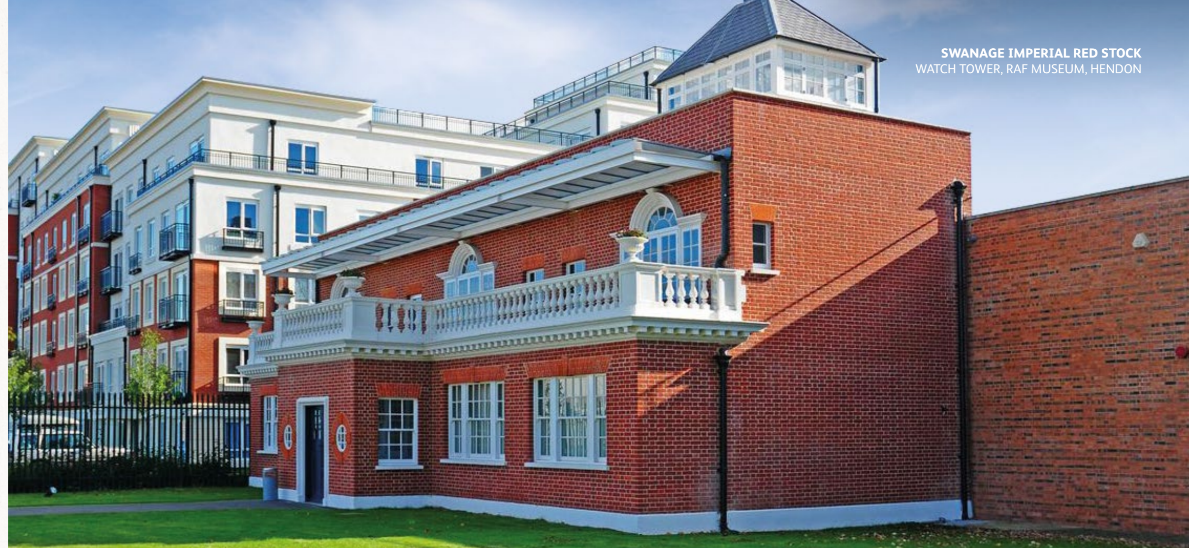
SWANAGE IMPERIAL RED STOCK WATCH TOWER, RAF MUSEUM, HENDON