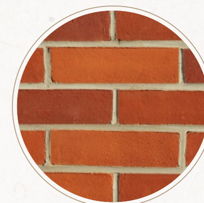
SWANAGE BESPOKE BLEND D