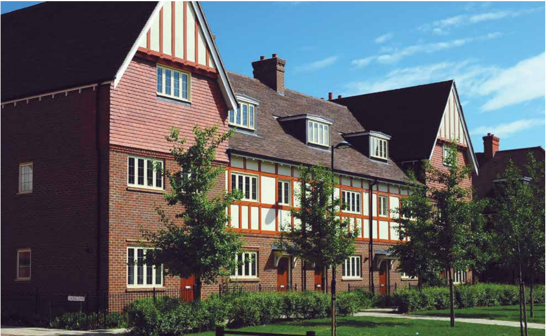
Private Housing, Sixfields, Northampton