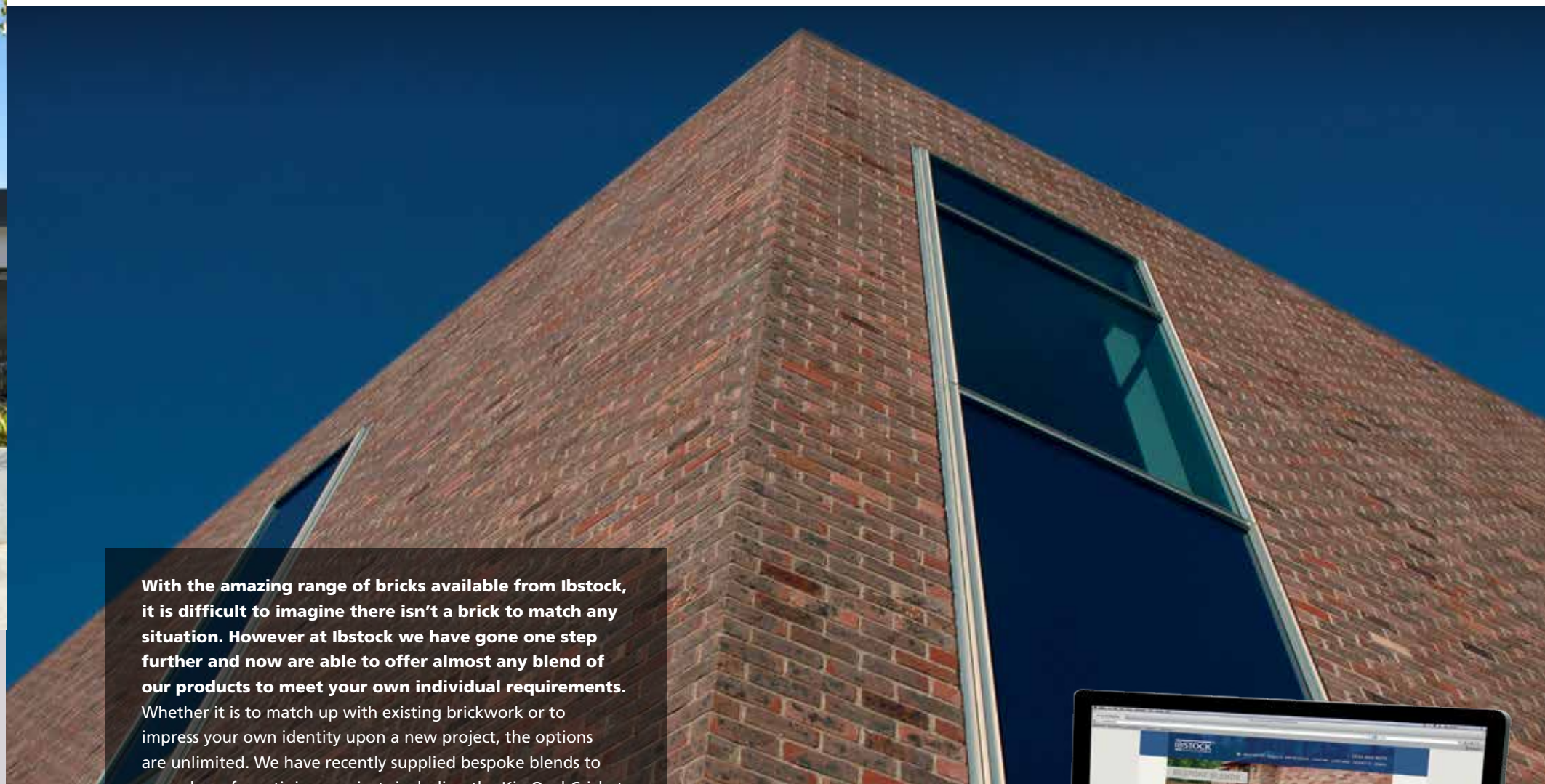
West Hoathly Bespoke Blend; Civic Offices, Addlestone, Surrey

It is simple to use and can really help you to design the perfect product for your project – You can even select what colour mortar to use for your blend as this can have a dramatic effect on the appearance of the brickwork.