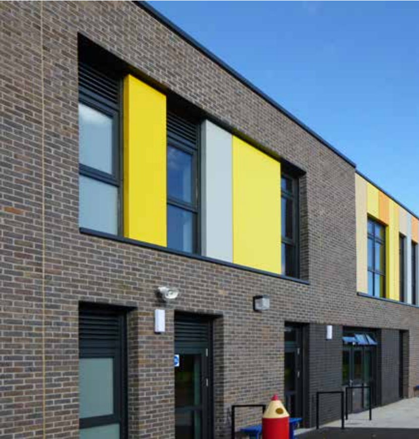
Primary School, Cambuslang, Glasgow