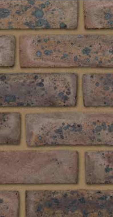
Private House, Three Bridges, West Sussex