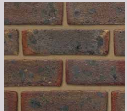
Private House, Wimbledon, Surrey