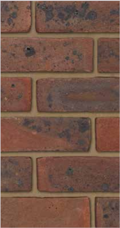
Apartments, Rathmines, Dublin