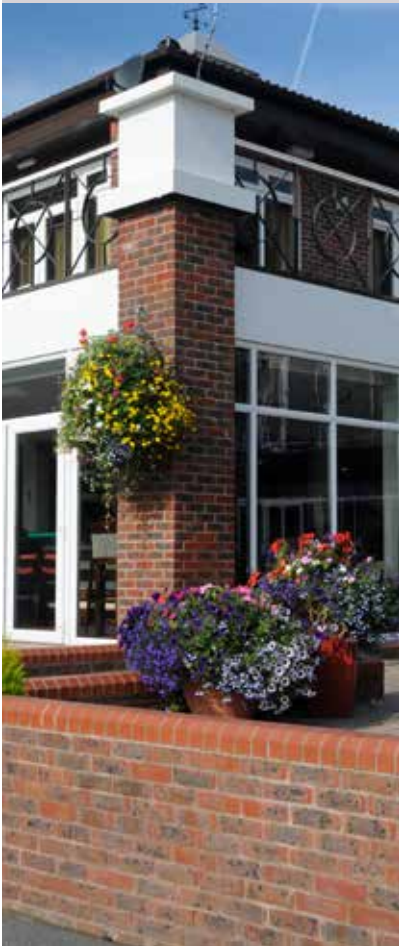
Golf Club, Formby, Merseyside