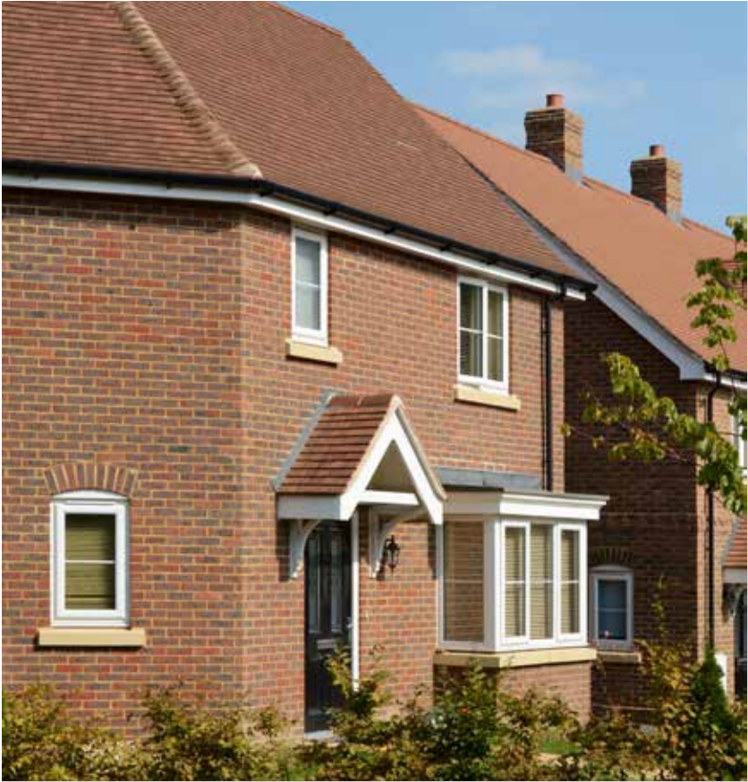
Housing, Lindfield, West Sussex