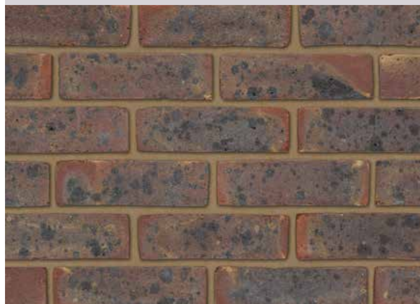
West Hoathly Dark Multi Stock 0735