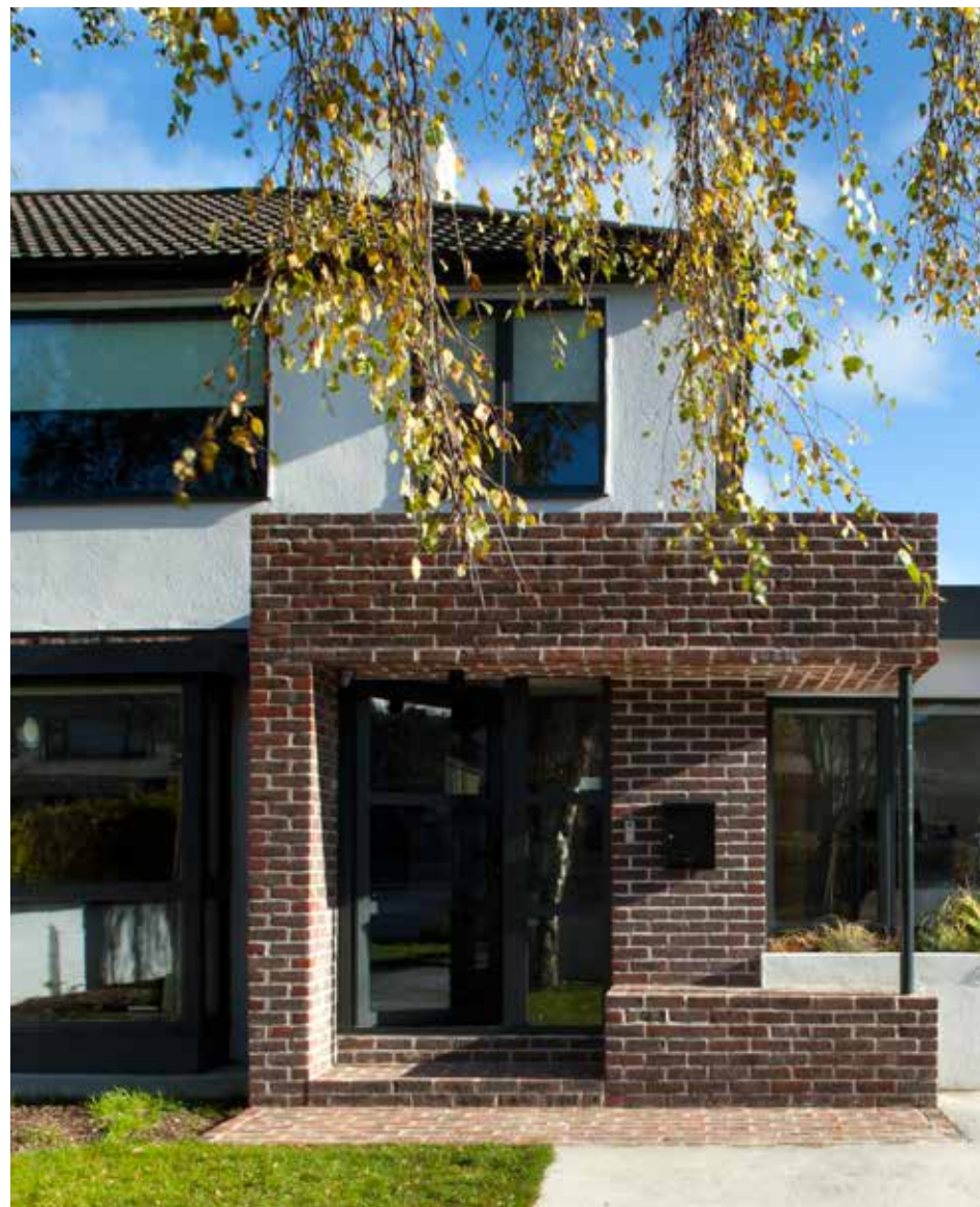
Private House, Dublin