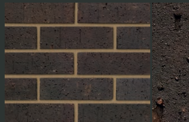
Himley Ebony Black