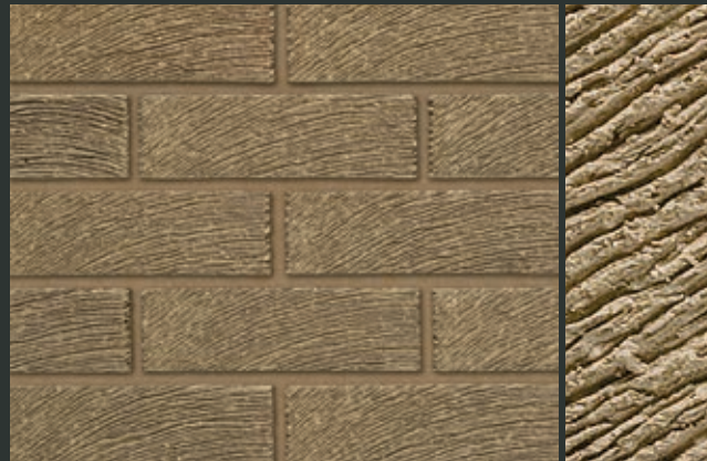
Silver Grey Rustic