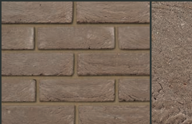
Bradgate Medium Grey