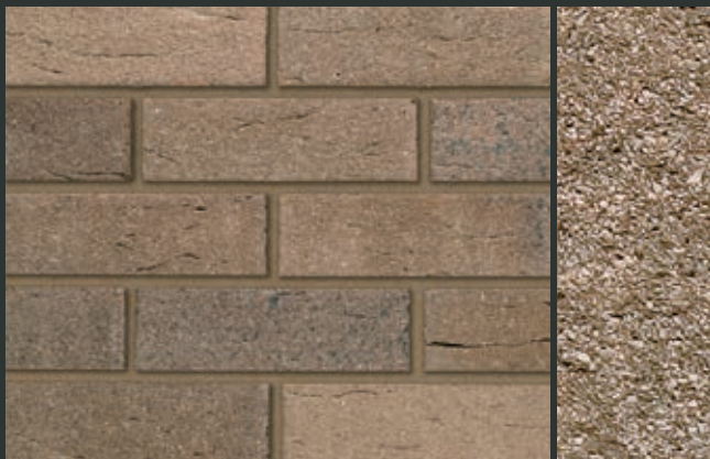
Brunswick Tryfan Grey