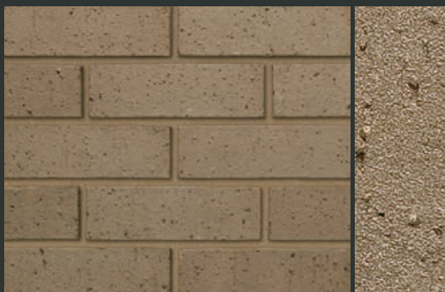
Himley Ash Grey