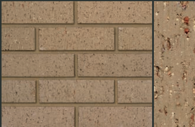
Royston Silver Grey