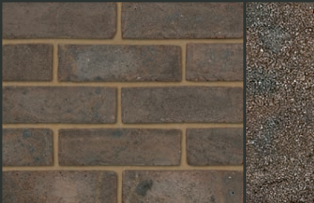
Tonbridge Handmade Grey Brown ▲