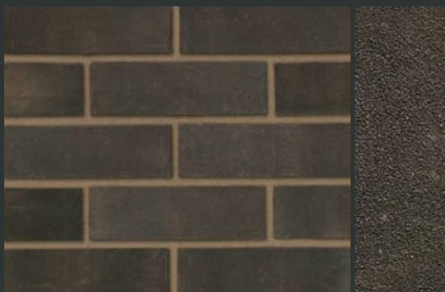
Holbrook Sandfaced Dark