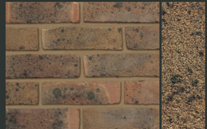
Crowborough Multicoloured Stock