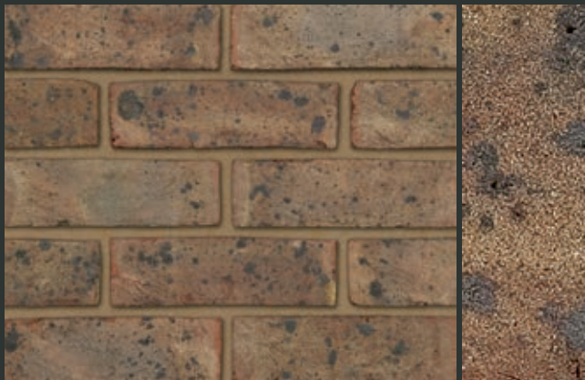
Tonbridge Handmade Heather Grey ▲