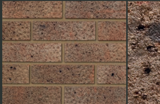
Tradesman Antique Grey