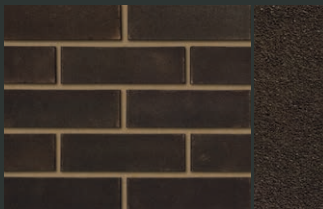
Holbrook Sandfaced Black