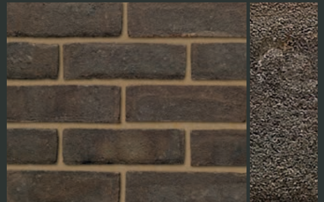
Bevern Dark Multi Stock ▲