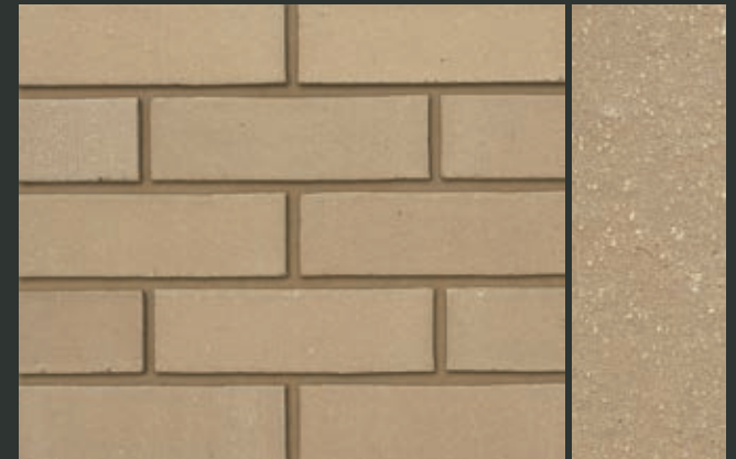
Throckley Smooth Grey