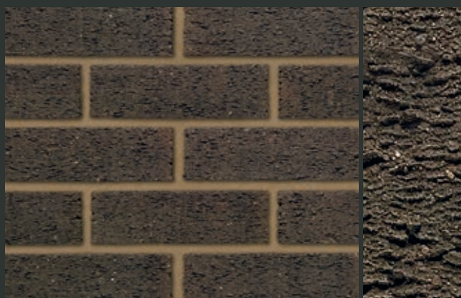
Multi Grey Rustic