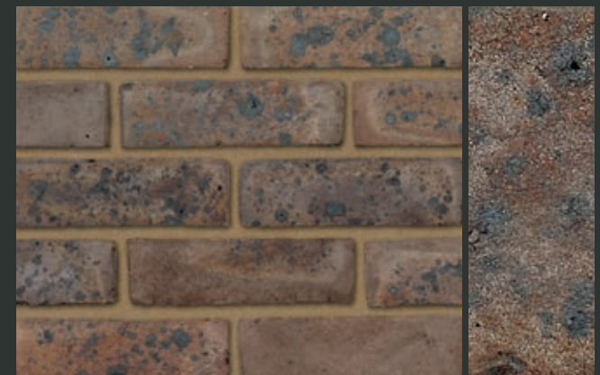
Kingscote Grey Multi