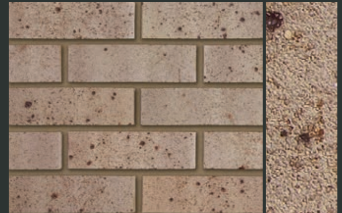
Tradesman Light ●