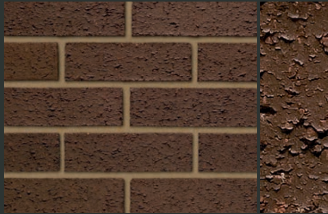
Bracken Brown Rustic