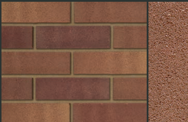
Tradesman Heather Mixture ●