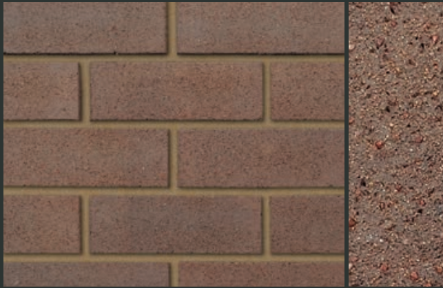
Border Brown Sandfaced 73mm