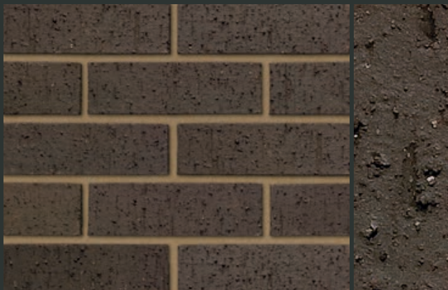
Himley Dark Brown Rustic