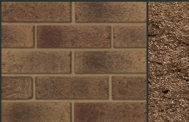
Milburn Ashen Brown Blend