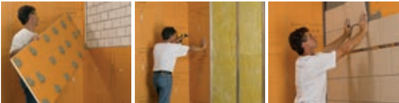
SUBSTRATE, STRUCTURAL PANEL, BONDED WATERPROOFING