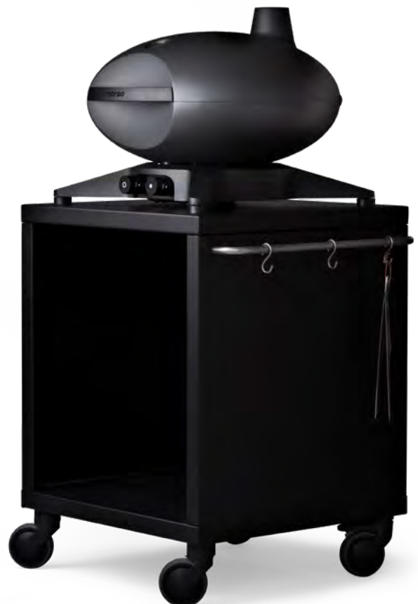
NEW in 2018 - Morsø Forno Gas