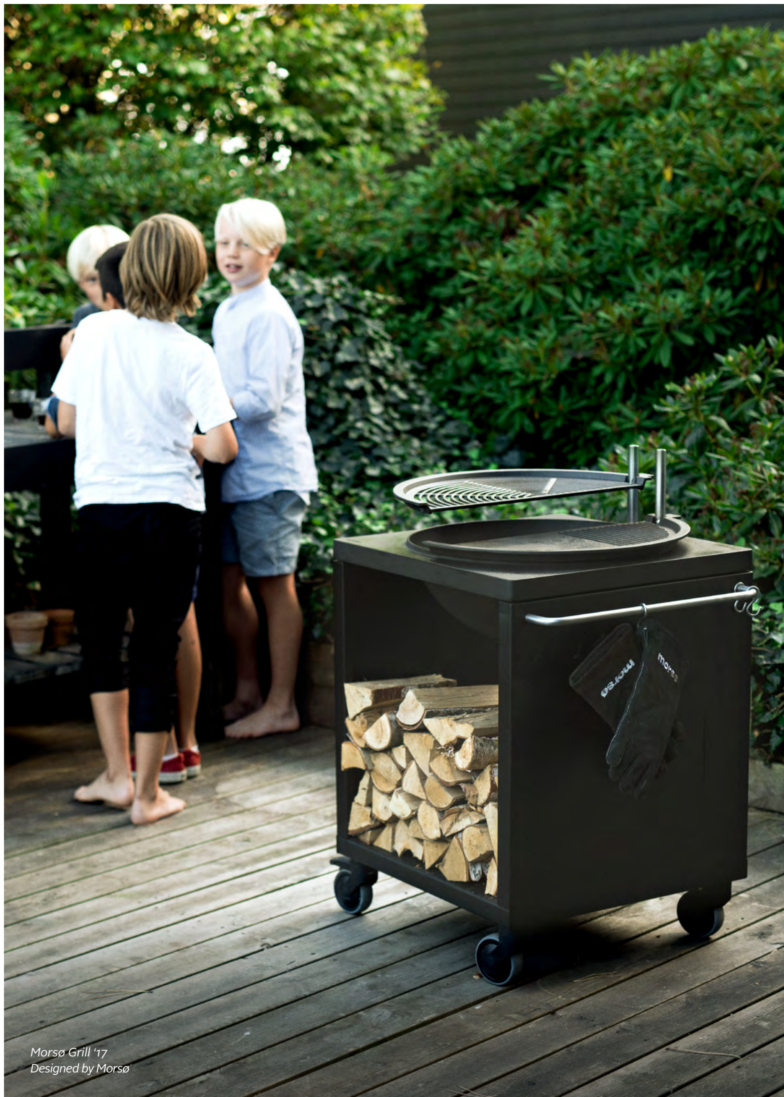
Morsø Grill '17 Designed by Morsø