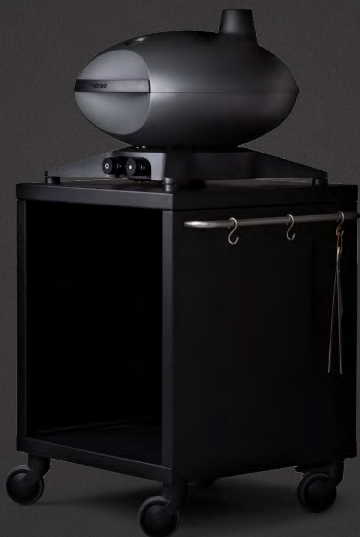
Morsø Forno Gas Designed for Morsø by Klaus Rath