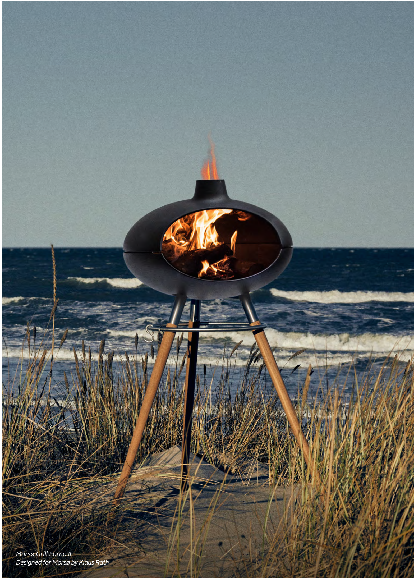
Morsø Grill Forno II Designed for Morsø by Klaus Rath