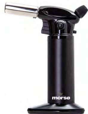
Morsø Gas Lighter