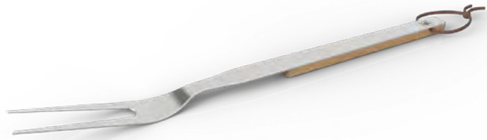
Morsø CULINA BBQ Fork