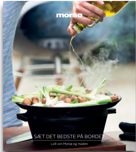
Morsø Outdoor Cookbook