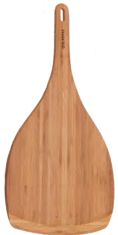
Morsø Paddle - bamboo pizza shovel