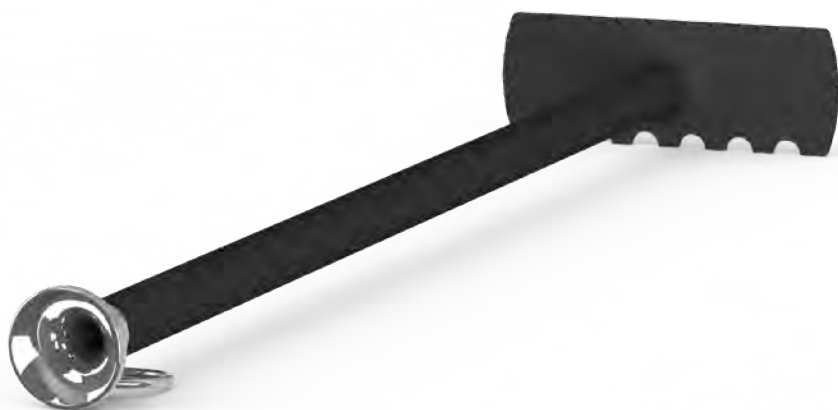
Morsø Ash Scraper