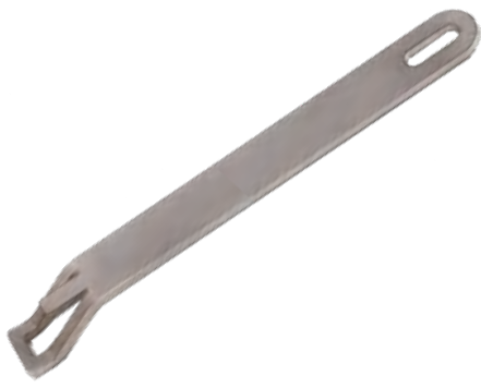
Morsø Handle for grill grate/grill plates