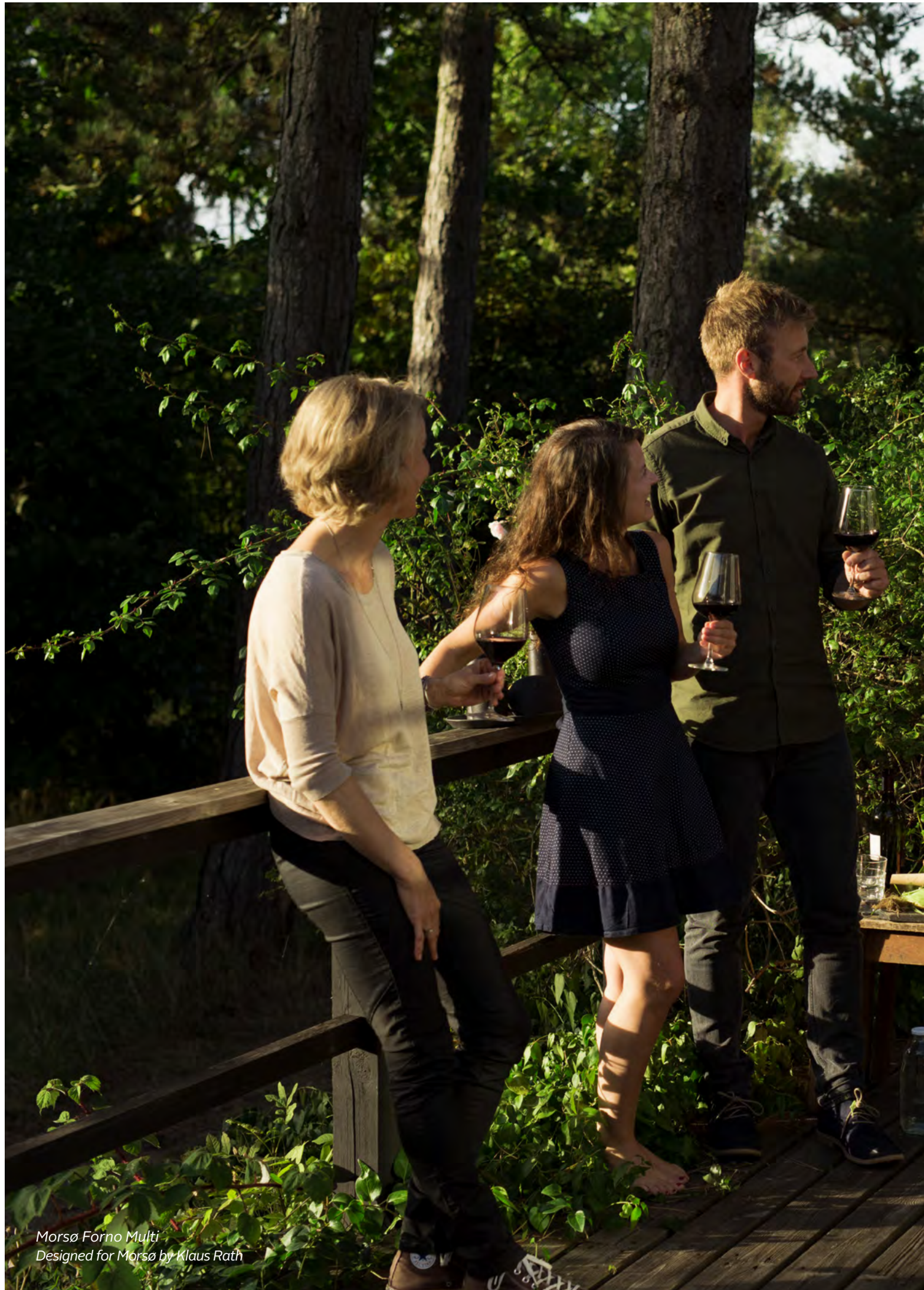
Morsø Forno Multi Designed for Morsø by Klaus Rath