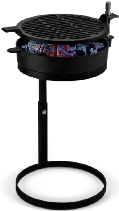
Morsø Grill '71