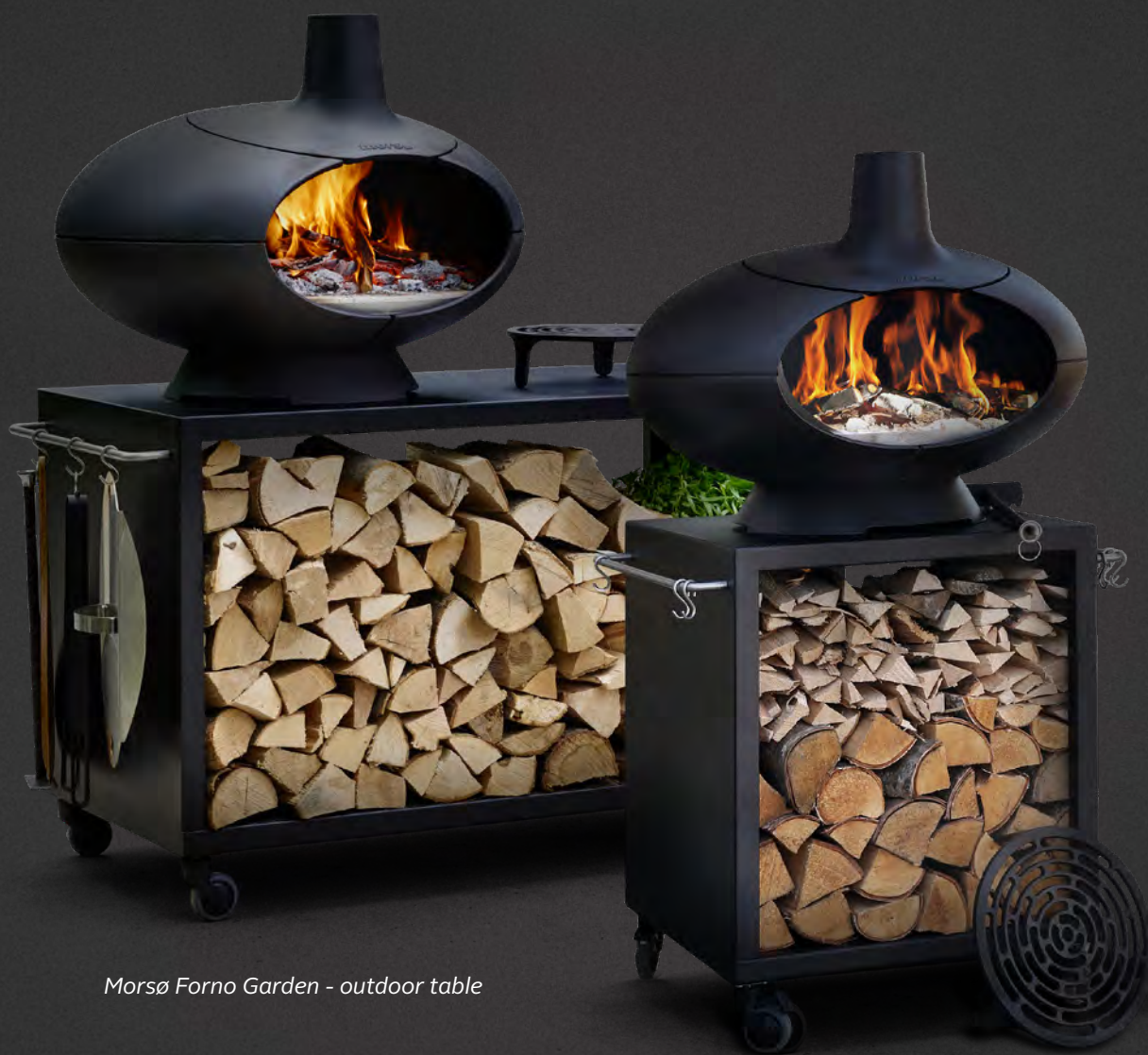
Morsø Forno Garden - outdoor table