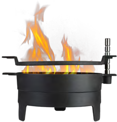
Morsø Grill '71 Table