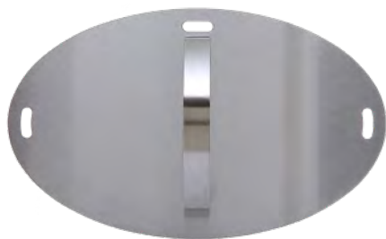
Morsø Grill Forno Door