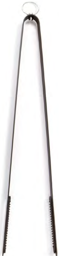
Morsø Fire Tongs