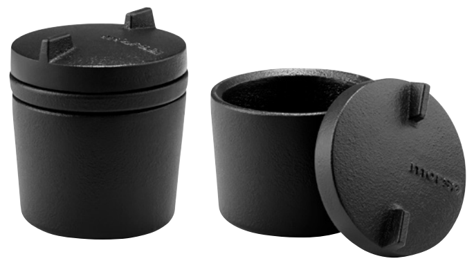
Morsø Spice '14 Morsø Salt '14