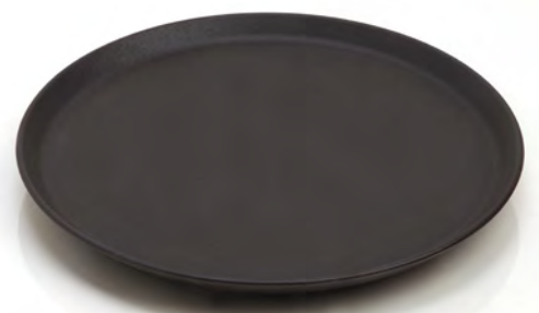
Morsø Frying Dish Ø32 cm