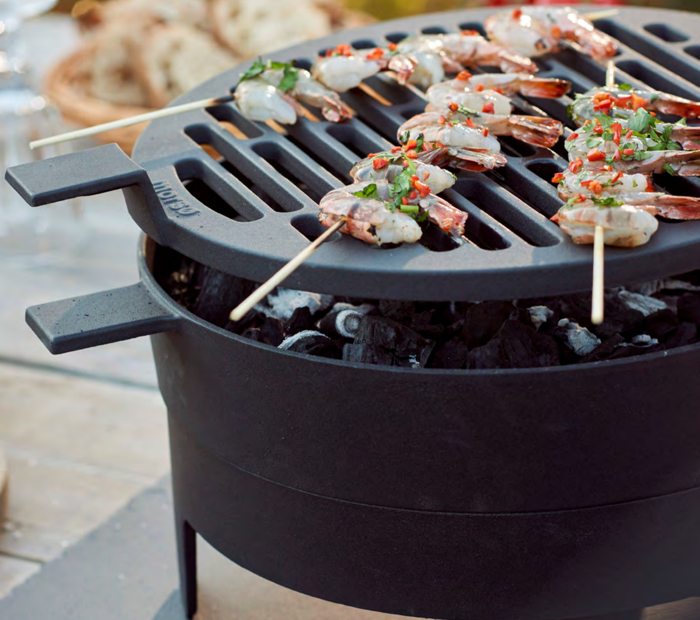
Morso Grill '71 Table Designed by Morso