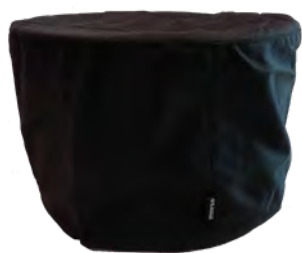
Morsø Jiko Cover