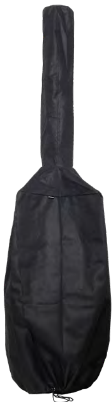
Morsø Kamino Cover