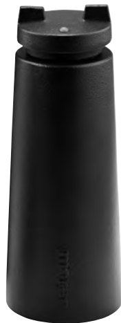
Morsø Mill '14