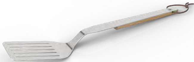
Morsø CULINA BBQ Turner