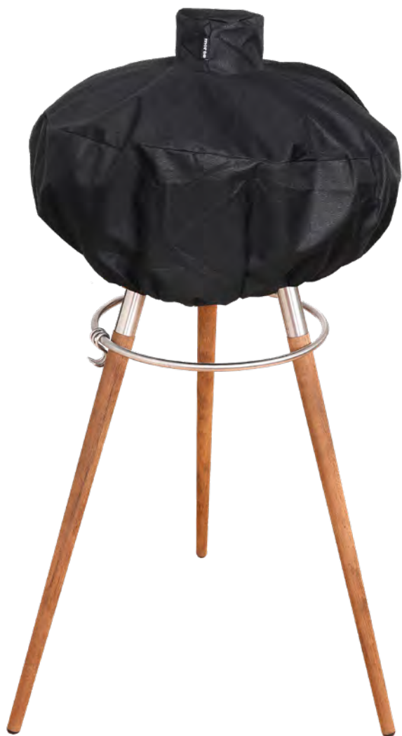
Morsø Grill Forno Cover