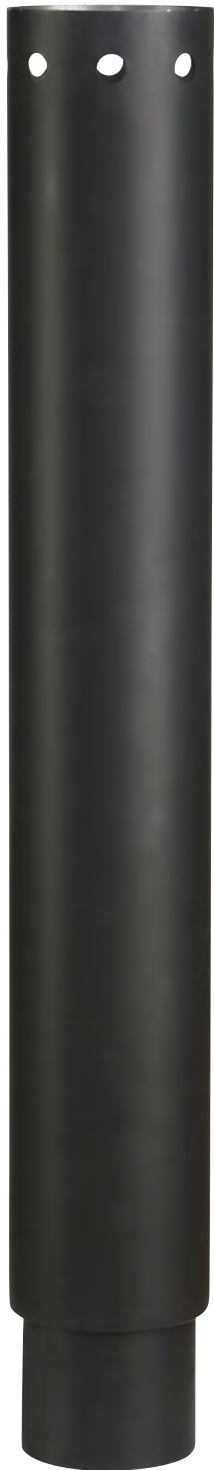
Morsø Forno Flue Pipe