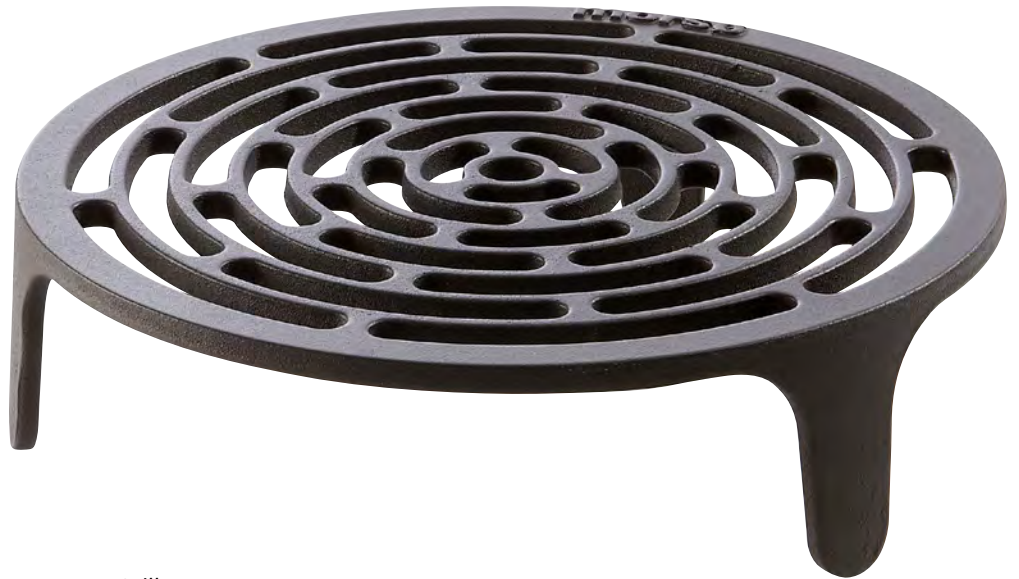
Morsø Tuscan Grill