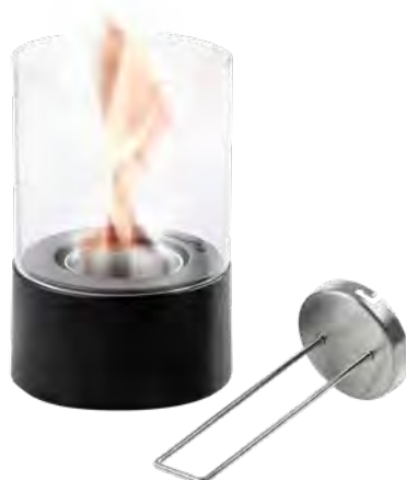
Morsø Bel - bio-ethanol lamp