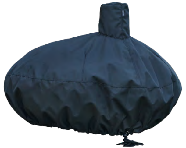
Morsø Forno Cover