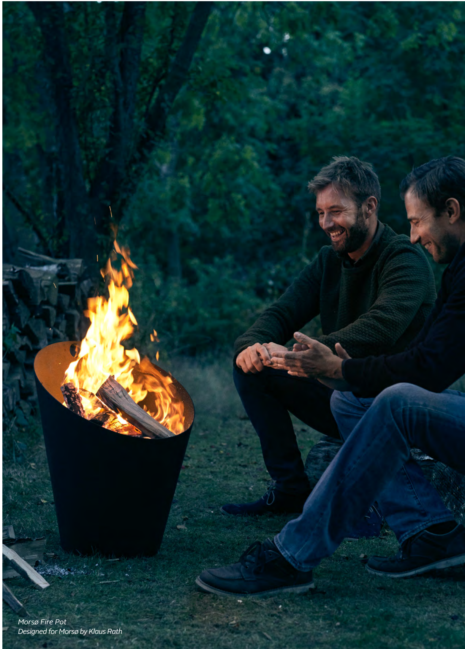
Morsø Fire Pot Designed for Morsø by Klaus Rath