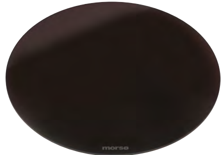
Morsø Vetro - Pizza- & Fryingplate