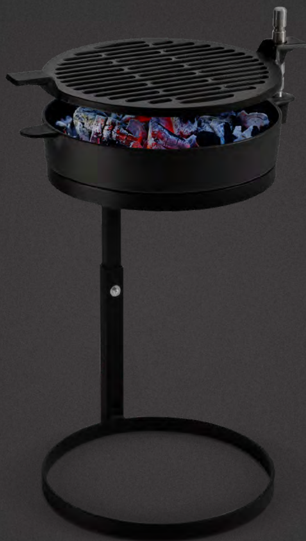
Morsø Grill '71 Designed by Morsø