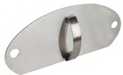
Morsø Forno Door