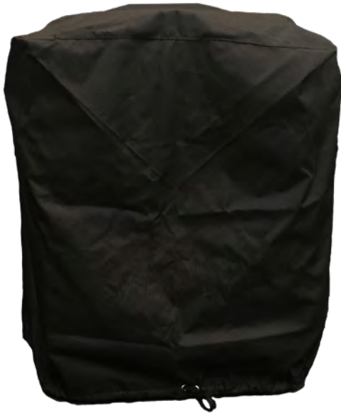
Morsø Grill '17 Cover