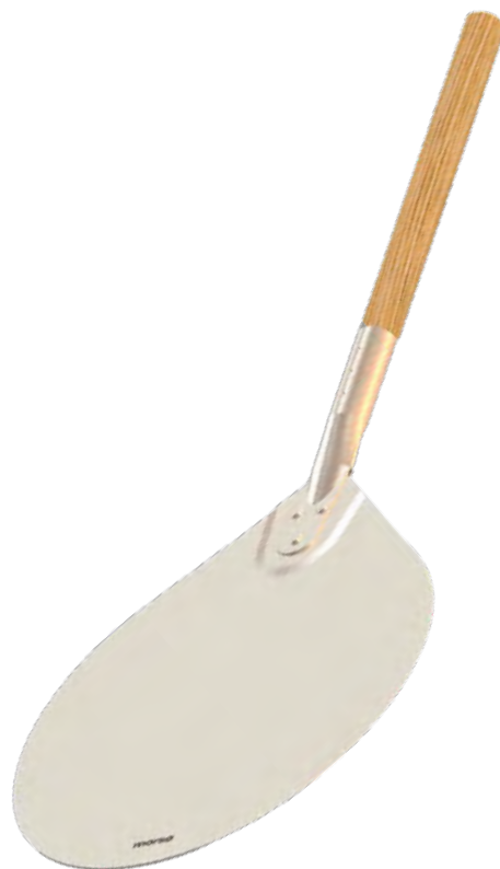
Morsø Peel - alu pizza shovel