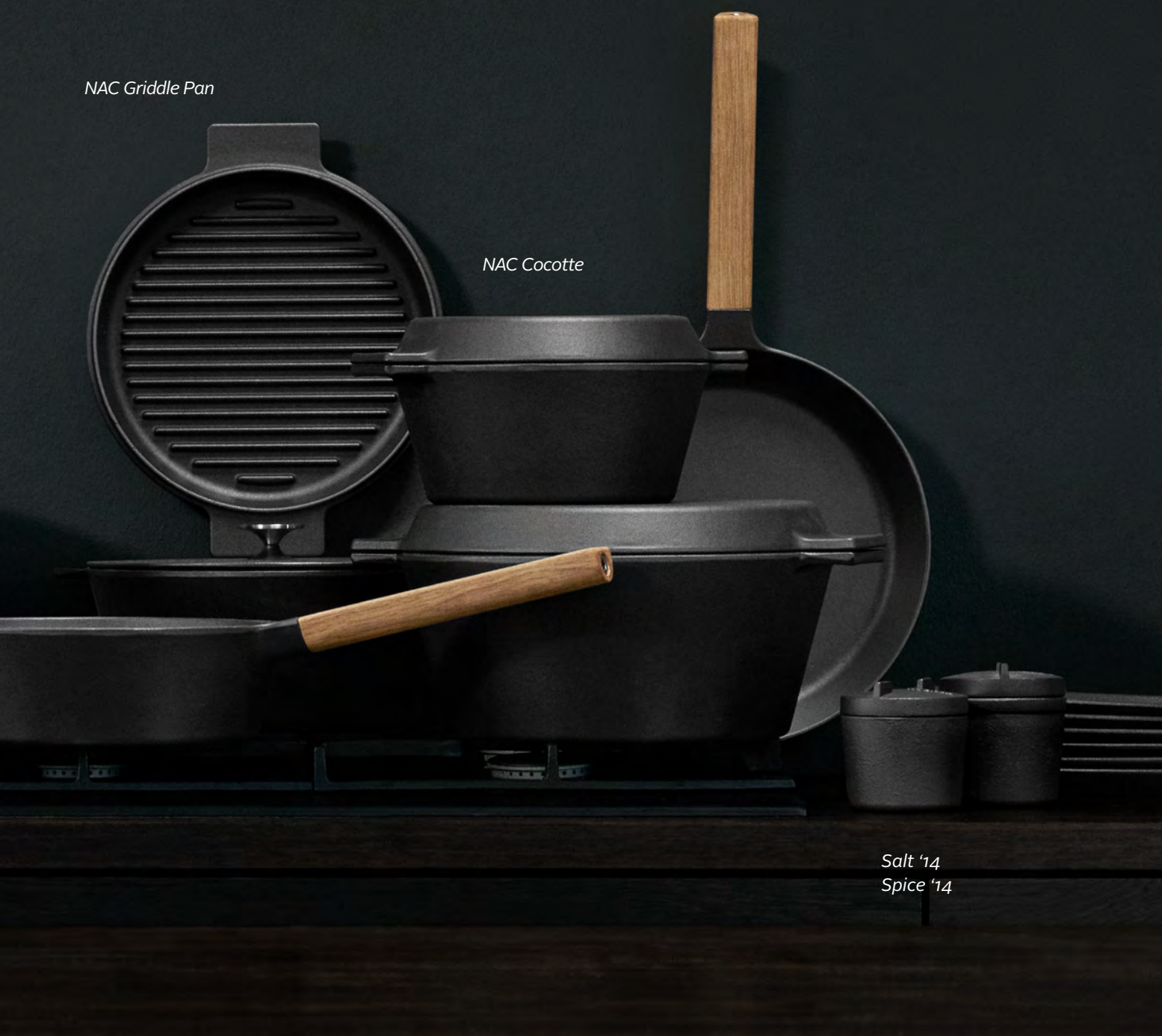
Salt '14 Spice '14