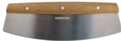
Morsø Pizza- & Herb Cutter