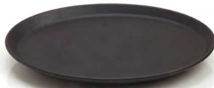
Morsø Grill Plates - 2 pcs