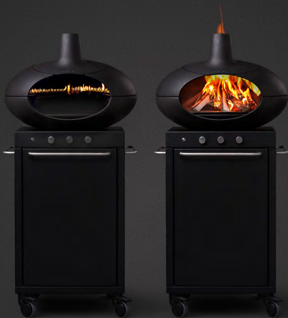
Morsø Forno Multi Gas and wood fired outdoor stove