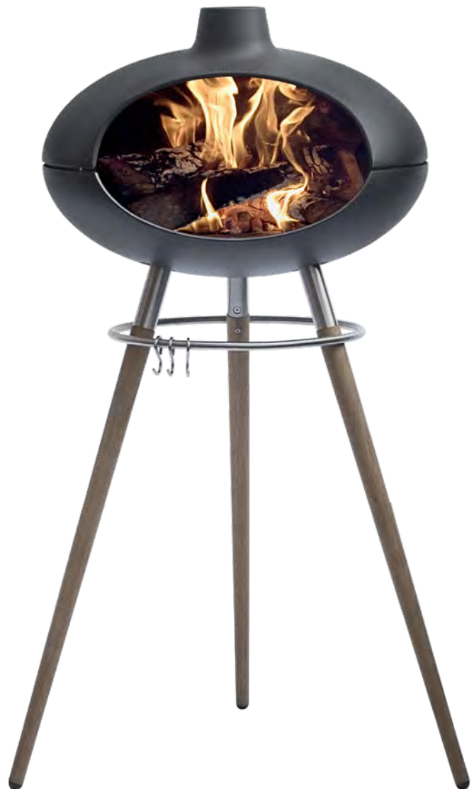
Morsø Grill Forno II