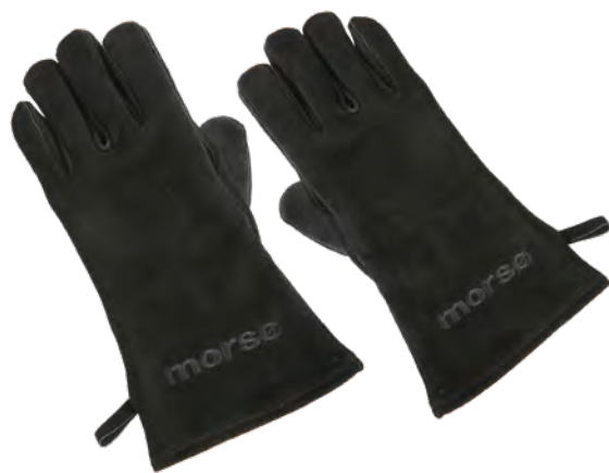
Morsø Grill Gloves R/L