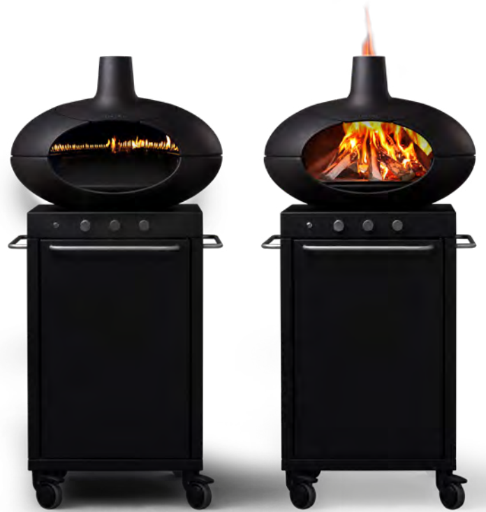
NEW in 2018 - Morsø Forno Multi - Gas and wood fired outdoor stove