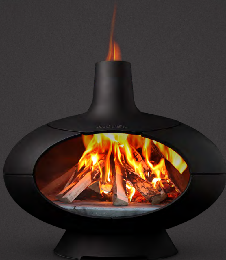
Morsø Forno Designed for Morsø by Klaus Rath