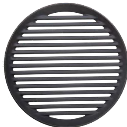
Cast-iron inserts for Grill Forno