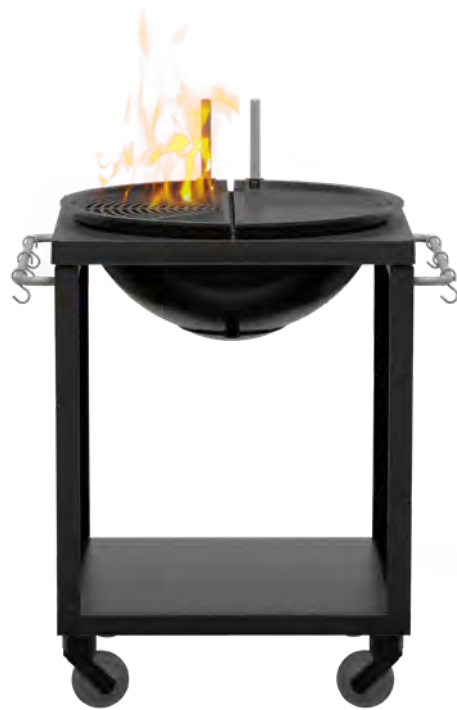
Morsø Grill '17