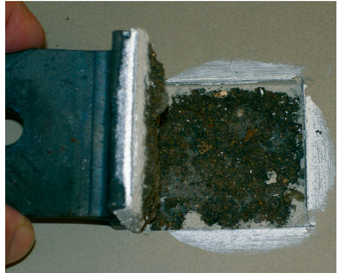
Pull-off strength test seal on reinforced and levelled cementitious screeds.

As water-based and extremely fluid emulsion the penetrating primer UZIN PE 425 can be generously applied to the mineral-based substrate and penetrate it deeply. This leads to the deep reinforcement of the entire top screed surface. The reinforcement effect of UZIN PE 425 is therefore far superior to customary film-forming epoxy resin primers. Brittle screeds, which would actually need to be removed, can be "salvaged" for the new build-up of floor constructions.