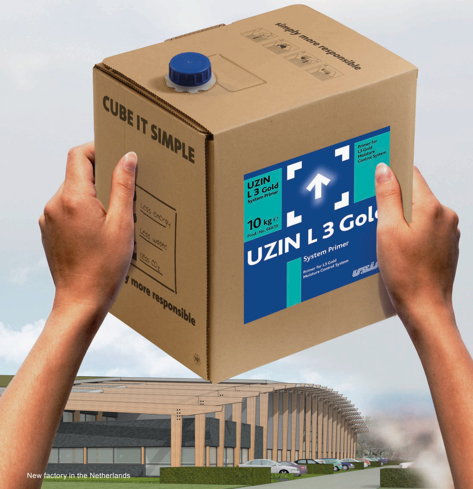
New factory in the Netherlands