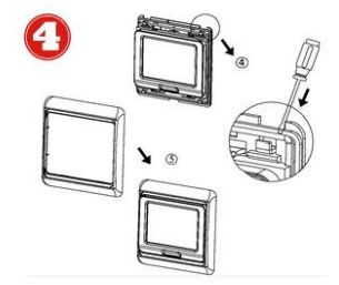
Install the housing cover and lock the external frame

Thermostat must be installed by a fully qualified electrician and all wiring must meet most recent wiring regulations.