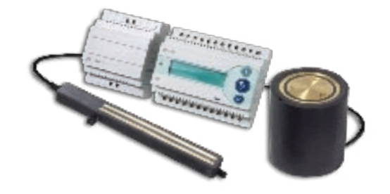
devireg 850 digital snow and ice sensor

This system makes it possible to create connectors and terminals for DEVI heat tape with protective braiding in under 90 seconds, removing the need for awkward tucking/fitting. This connection technology is both highly compact and available in a range of types, e.g. for T and X junctions.