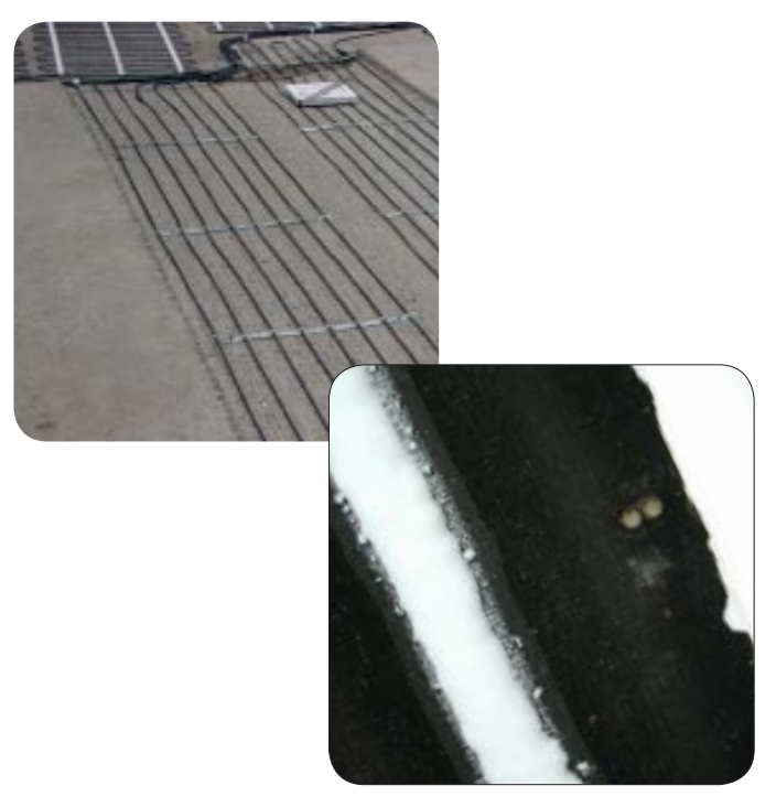
Frost protection/ice and snow melting for paths, ramps and driveways

Installing deviflex cables within the ground provides a maintenance free and economic solution. Cables are laid in evenly spaced loops and then encased in the ground.