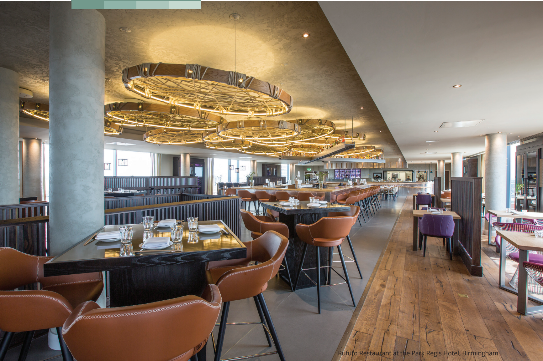
Rufu Restaurant at the Park Regis Hotel, Birmingham