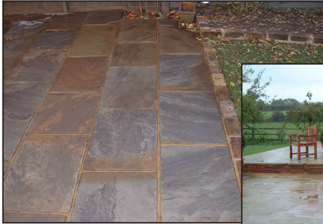
Grange Yorkstone Paving