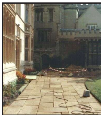
Priori Yorkstone Paving

Colour Priori - Buff yellow Grange - Varying buff, brown and grey.