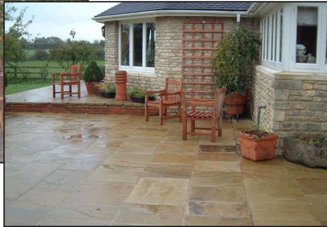
Priori Yorkstone Paving

Please note that colours may differ from the photographs shown.