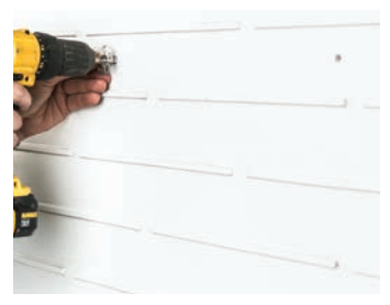
1 . The ribbed backing panel is fixed to the substrate.