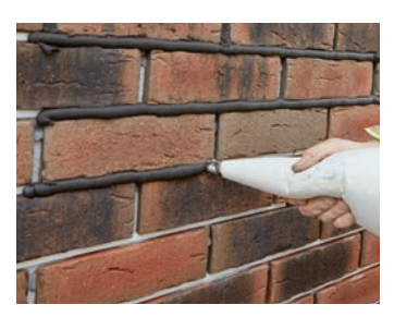
3. Specially formulated mortar is then piped into the brick joints.