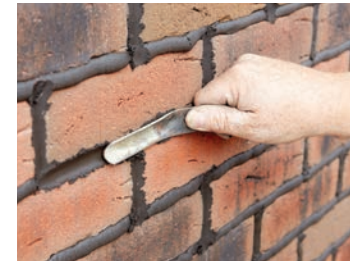
4. Mortar is tooled in the manner of traditional pointing.