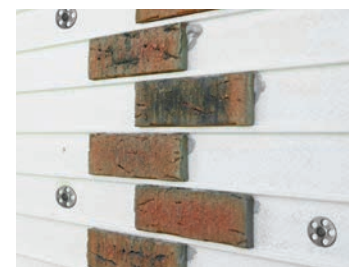
2. Brick slips are attached with permanent bonding adhesive.