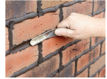
4. Mortar is tooled in the manner of traditional pointing.

3. Specially formulated mortar is then piped into the brick joints.