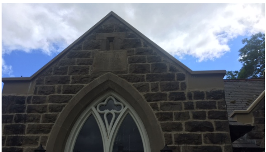
The original natural stone walling is complemented by the new cast stone