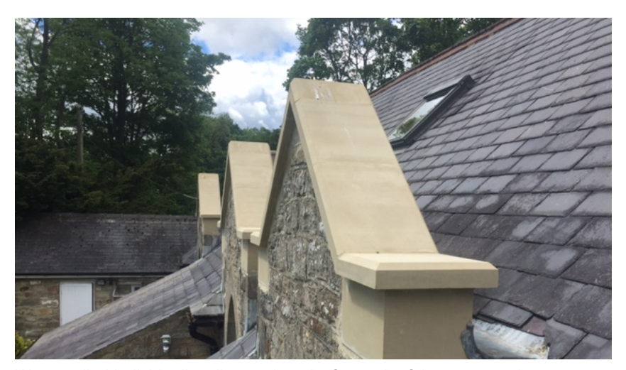
We supplied individually tailor made units for each of the renovated areas