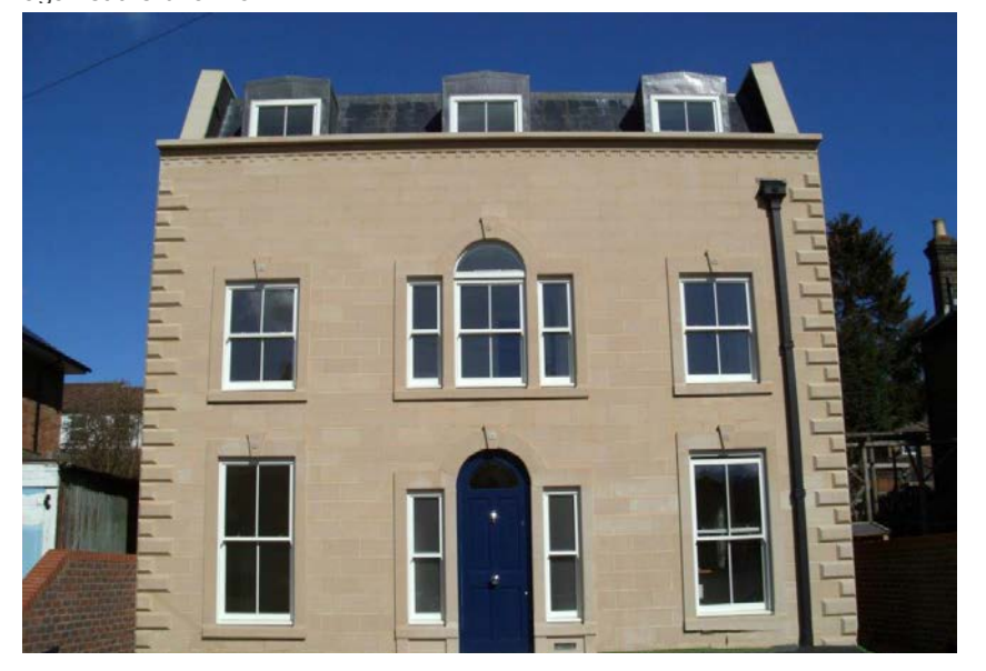
The front of the new house which looks every bit as though it was built in natural stone