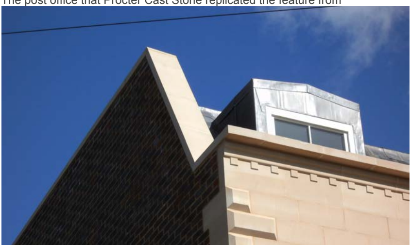
The quoins look especially impressive when viewed from the side and against the brickwork.

The post office that Procter Cast Stone replicated the feature from