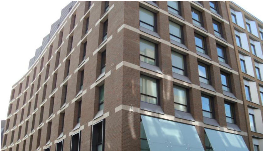
New Premier Inn hotel in central London showing extensive use of cast stone