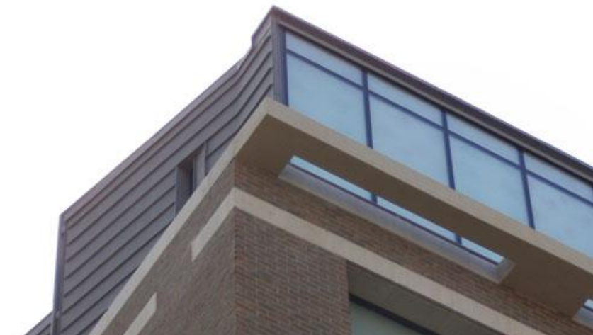
A great example of how cast stone can work well in contemporary architecture

www.caststoneuk.co.uk www.concrete-posts.co.uk