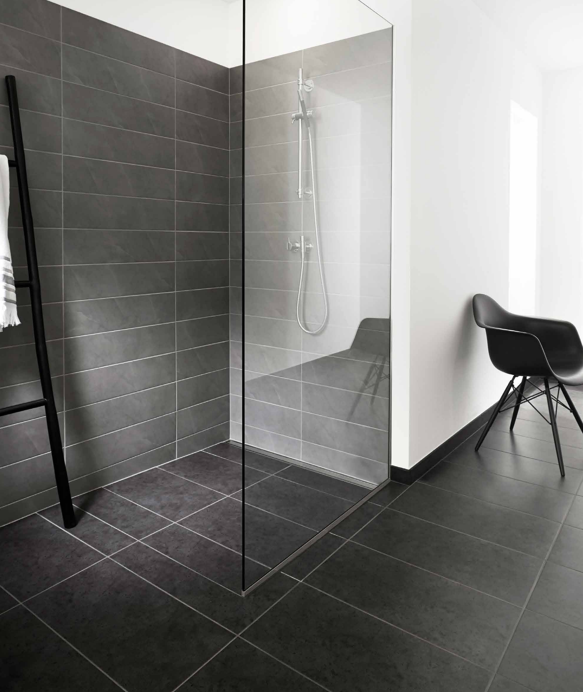
GLASSLINE shower screen | Transparent HIGHLINE floor drain | Panel with frame