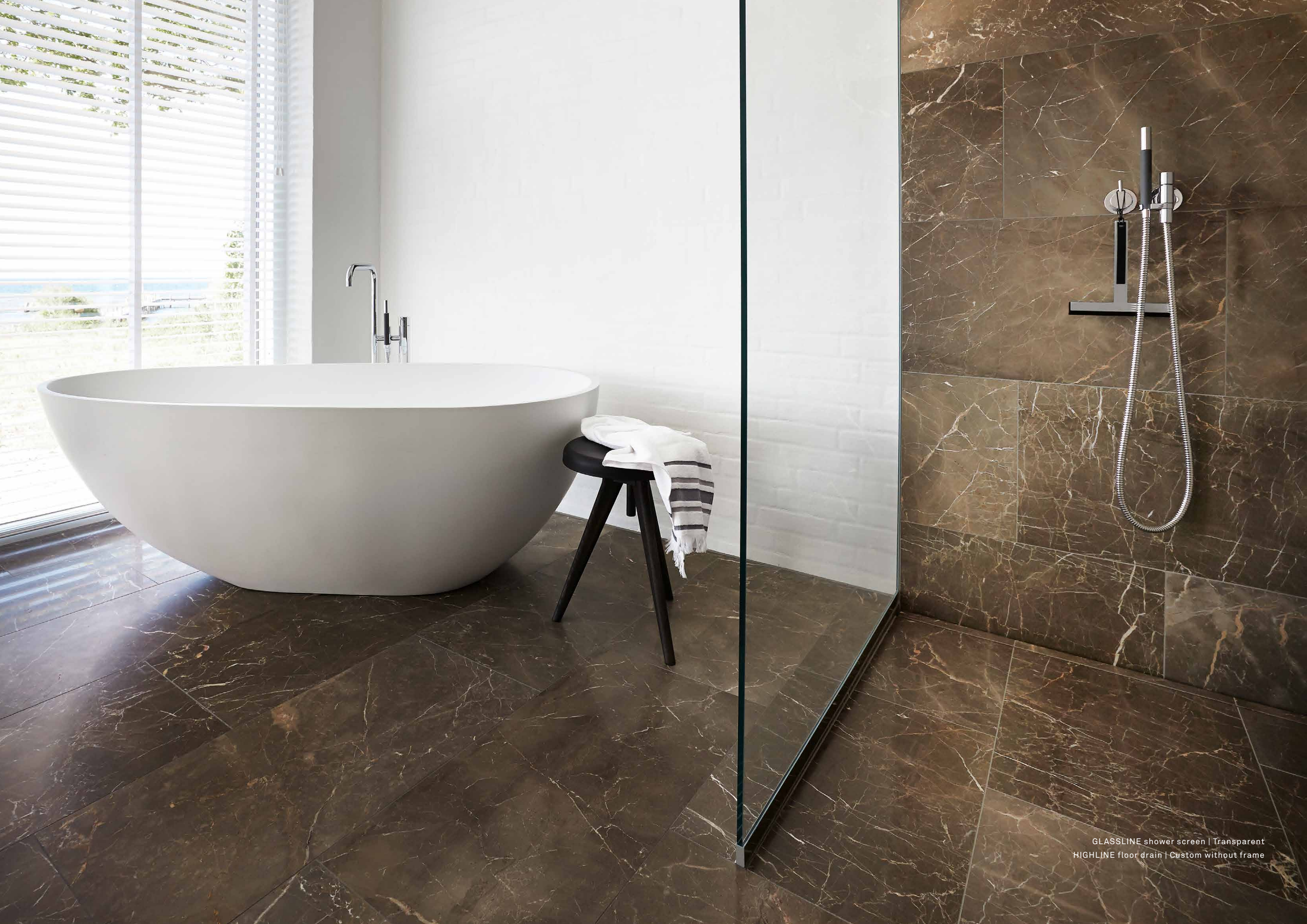
GLASSLINE shower screen | Transparent HIGHLINE floor drain | Custom without frame