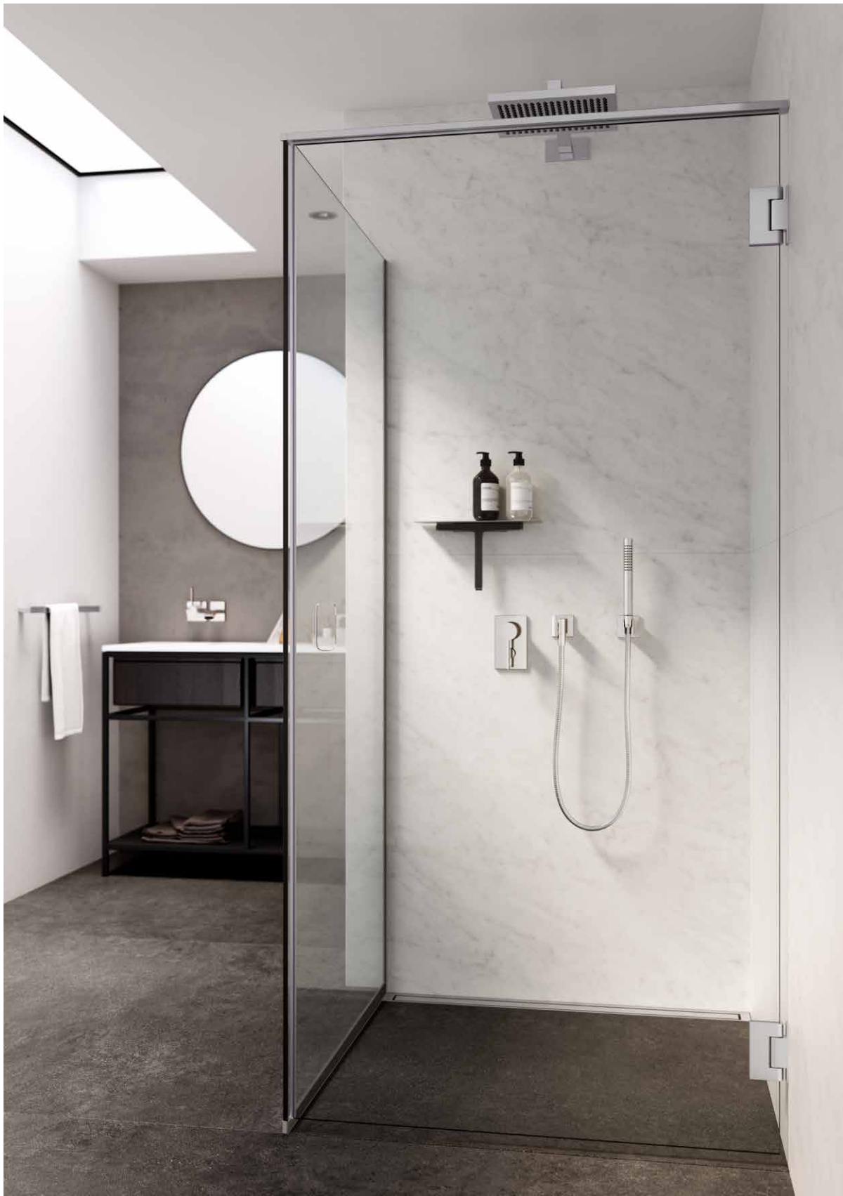
GlassLine Shower door, top rail | steel ClassicLine floor drain | Column