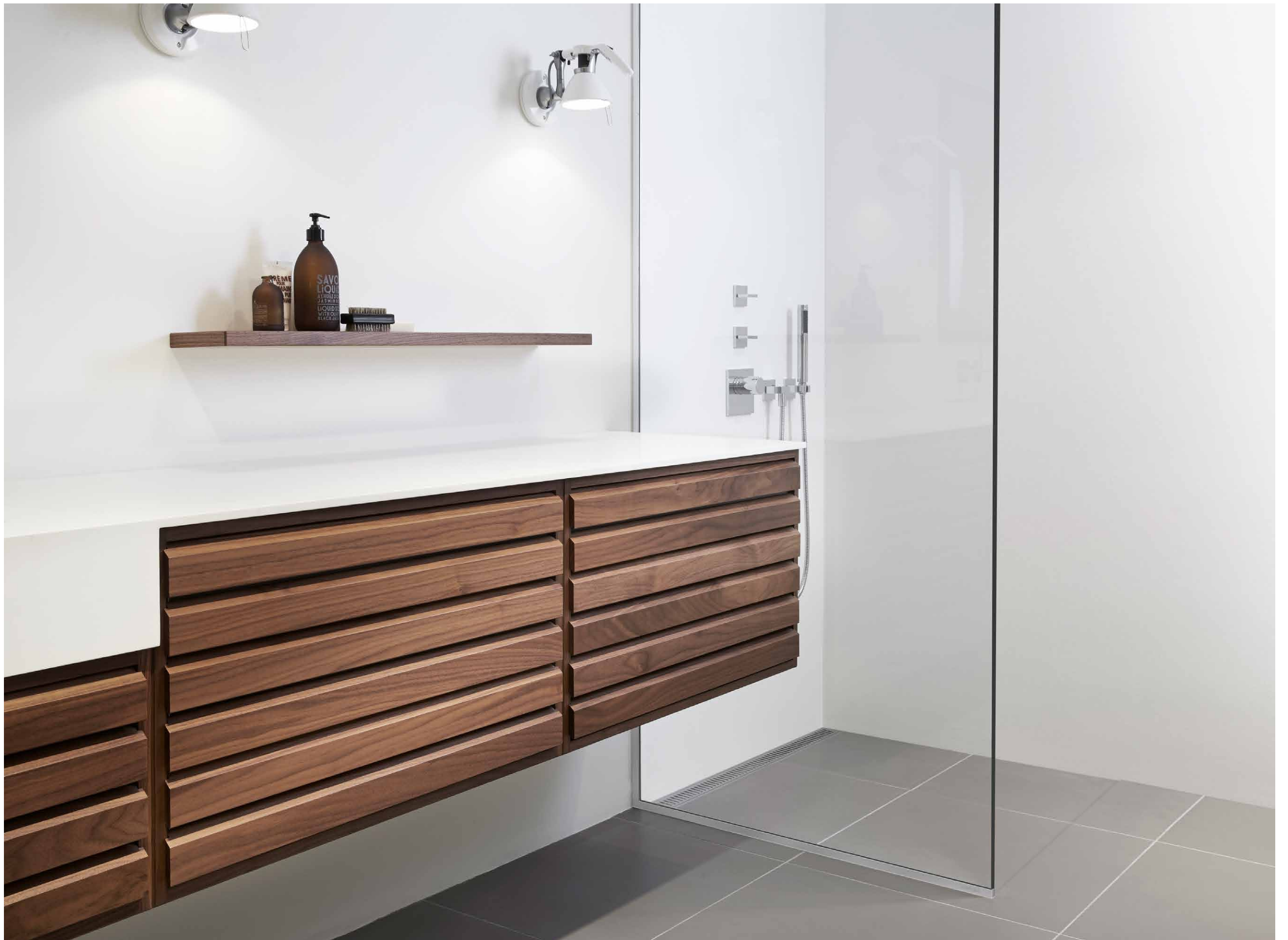
GLASSLINE shower screen | Transparent CLASSICLINE floor drain | Column