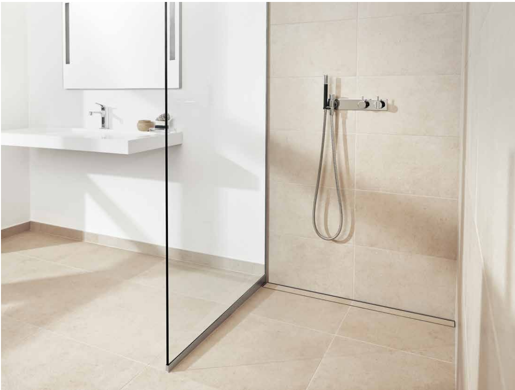
GlassLine shower screen | Transparent HighLine floor drain | Custom