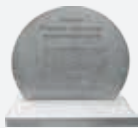
"Innovation product" Green Interior Awards Australia - Jul. 2017