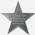
"Gold Star" Professional Excellence Award Spain - Nov. 2017