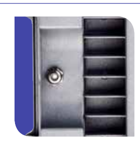
IP65 cable gland and side cable inlet to aid installation