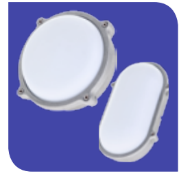
Wide light diffusion patterns for optimum area coverage.